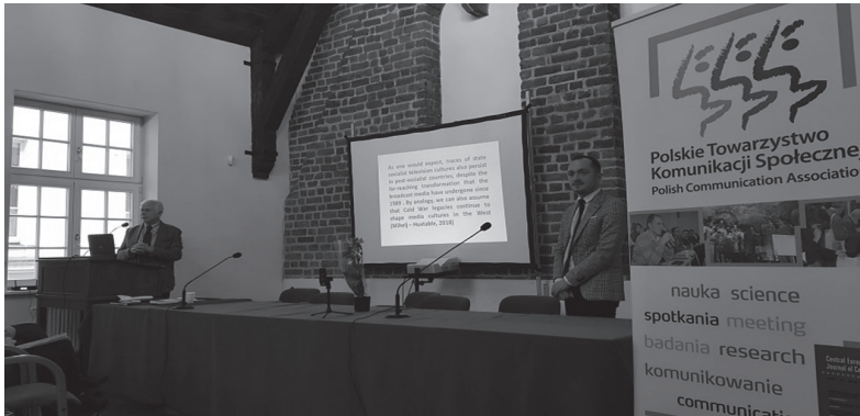
Photo: Prof. Paolo Mancini and dr hab. Michał Głowacki during the conference

On November 19, 2018, in the Ossolineum conference room, a jubilee conference summing up the 10 years of operation of the official journal of the Polish Communication Association — the Central European Journal of Communication (CEJC) — took place. More than 50 scholars from Poland and Europe participated in the five thematic panels dedicated among other things to Central and Eastern Europe (CEE) in the perspective of media systems studies, and publishing in the region.