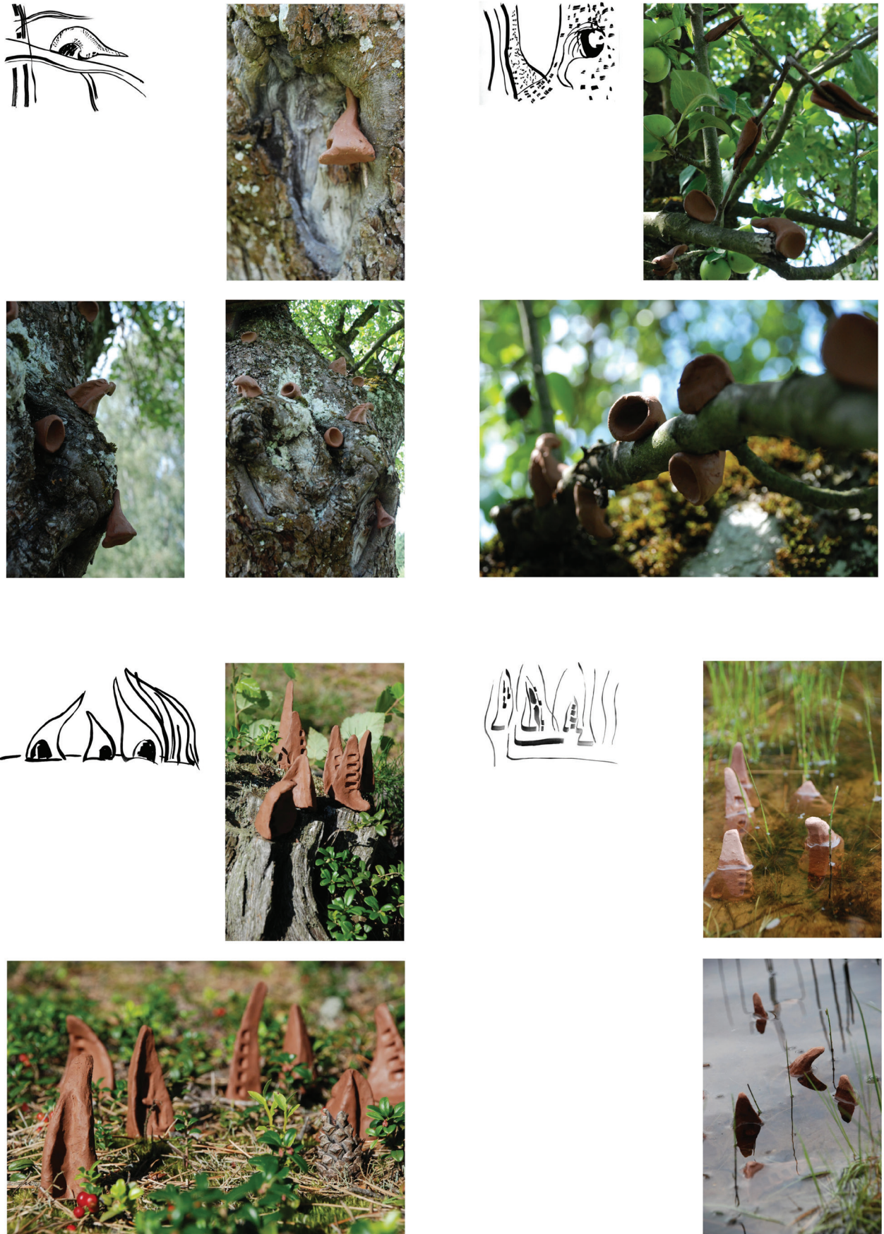
Fig. 2. Selected activities as part of the author's original project entitled "Kashubian residence. In search of bionic relations". Schelters (elaborated by A. Kurkowska)

II. 2. Wybrane działania w ramach projektu autorskiego pt. „Kaszubskie zamieszkiwanie. Poszukiwanie relacji bionicznych”. Schronienia (oprac. A. Kurkowska)