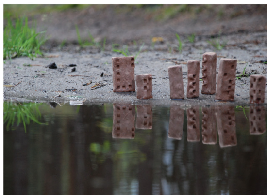
Fig. 3. Selected activities as part of the author's project entitled "Kashubian residence. In search for bionic relations".

Sets of repeating elements (elaborated by A. Kurkowska)