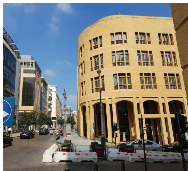
Fig. 11. New architecture in Art Déco style at the corner of Al Lenbi and Weygand Streets Corner of the building based shaped as semi-cylindrical with typical Art Déco aesthetics. General composition adjusted to “Haussmannian” rules – upper floors withdrawn from the line of the frontage, lower two floors emphasised. Art Déco reminiscences – shape and division of windows, decoration of sandstone on the façade

– Aesthetics quality of the 19 th century and Art Déco architecture and urbanism has been evaluated by the time and is easily understandable by broad strata of society. Such quality, even reconstructed, attracts not only the city inhabitants but tourists as well – especially in cities destroyed in the war conflicts. Beirut's historical district became the largest area of beautiful, homogeneous aesthetics in Lebanese capital. The scale of new infills in the urban plan and composition of façades of new architecture