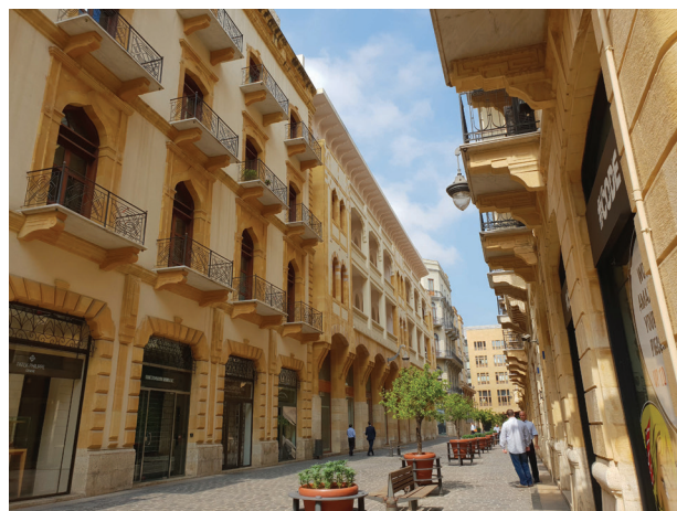
Fig. 1. Beirut Central District, Saad Zaghoul Street – pedestrian area between Waygand, Al Lenbi and Foch Street with carefully reconstructed tenement houses from the late 19 th –early 20 th century. Islamic revival and neo-classical detail, renovated interiors and new urban detail with greenery designs. At the end of axis of view – new, context architecture at Al Lenbi Street is visible

Il. 1. Beirut Central District, ul. Saad Zaghouloula – strefa wyłączona z ruchu kołowego pomiędzy ul. Wayganda, Allenby'ego i Focha z pieczołowicie zrekonstruowanymi kamienicami pochodzącymi z końca XIX i początku XX w. Kamienice mają odtworzony detal neoklasycystyczny i neootomański, poddane renowacji wnętrza, a we wnętrzu urbanistycznym ulicy widoczne są nowe rozwiązania zieleni i detalu urbanistycznego. Na końcu osi widokowej ulicy, przy ul. Allenby'ego, widoczna współczesna, dopasowana do kontekstu urbanistycznego architektura nowej kamienicy