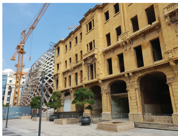
Fig. 4. El Moutran Square's southern façade of adjacent quarter composed by two, currently renovated or constructed buildings

Il. 3. Wnętrze Beirut Souks. Łuki bazaru pełnią nie tylko funkcję konstrukcji, ale są także reminiscencją lokalnego dziedzictwa kulturowego, bazarów pochodzących z czasów otomańskich. Również dekoracje w przestrzeniach pomiędzy nimi odtwarzają wzory stosowane w zewnętrznych żaluzjach okien i wykuszy tzw. mashrabiya