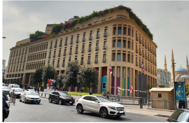
Fig. 8. Le Gray Hotel with a façade along Waygang Street designed with a vertical pre-modernist rhythm and divided into three sections as the original, pre-war plot lands layout. Also cornices and curved corners are derived from antebellum designs

town district from Martyrs' Square side and the end of axis of view which is composed alongside radial Hussein El Ahdab Street (the street is starting from Nejme Sq.). The two mosques at Weygang Street are defining the local landscape but in different ways. The Al Omari Grand Mosque is partially reconstructed – from the side of the street it was designed with contemporary façade with a minaret – a travesty of Art Déco architecture, perfectly blending into the local landscape. The Amir Asaf mosque is more modest, of raw aesthetics. Between them a garden of contemporary design was placed. The next building towards Martyrs' Square is the new Le Gray hotel, which has the original tenement house façade oriented towards the square, but elevations at Waygang Street are expanded on several old plots and designed in a modern way. In the vicinity of Waygang Street there are many contemporary buildings with sandstone façades like Le Gray Hotel with modern, reduced detail. The corners of new buildings like in original Art Déco buildings are curved or diagonally cut. Just like in the “Haussmannian” rules lots of them have 4 or 5 floors finished with large cornices, and the next