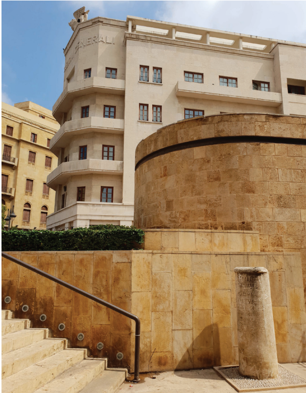
Fig. 7. Pavilion at the side of St. George church, which is an entrance to the Ancient mosaics collection exposed in situ, and under the church. The architecture of the building is based on curved, gentle lines and with one side is also a border line of street leading to the St. Elie church, so it suits perfectly the 1920s aesthetic climate of area

Il. 7. Pawilon zaprojektowany przy kościele pw. św. Jerzego jako wejście do prezentowanych in situ i pod kościołem odkrytych antycznych mozaik. Kompozycja architektury budynku oparta na zakrzywionych, delikatnych liniach, z jedną z elewacji tworzących linię zabudowy ulicy prowadzącej do kościoła pw. św. Eliasza, doskonale została wpasowana w dominującą w otoczeniu estetykę dwudziestolecia międzywojennego