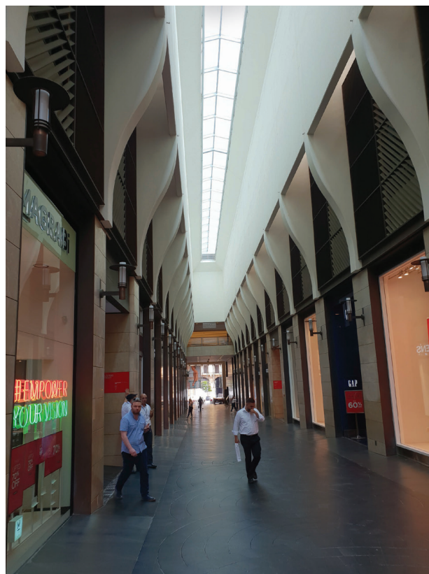
Fig. 3. Beirut Souks interior. Arches are not only constructions – they are reminders of the local cultural heritage – Ottoman souks, also patterns in the space between arches is derived from mashrabiya pattern of shutters

Il. 3. Wnętrze Beirut Souks. Łuki bazaru pełnią nie tylko funkcję konstrukcji, ale są także reminiscencją lokalnego dziedzictwa kulturowego, bazarów pochodzących z czasów otomańskich. Również dekoracje w przestrzeniach pomiędzy nimi odtwarzają wzory stosowane w zewnętrznych żaluzjach okien i wykuszy tzw. mashrabiya