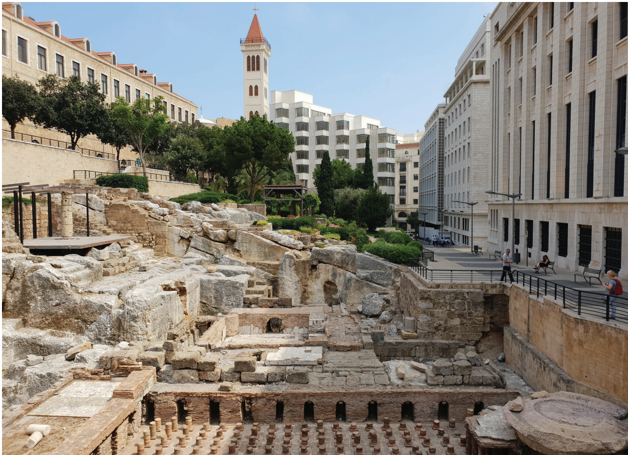
Fig. 10. Roman Bath at Serail Hill with archaeological excavations presented in situ and new gardens. The building in the back (northern frontage) with 1980s modernist aesthetics and from the Serail Hill perspective “over-sculptured” with too much diagonal composition façade

Il. 10. Łaźnie rzymskie – Roman Bath na Serail Hill – ekspozycja relikwów archeologicznych, prezentowanych in situ z zaprojektowanymi współczesnymi ogrodami. Budynek w tle (północna pierzeja wnętrza urbanistycznego) z modernistycznym obiektem, utrzymanym w estetyce lat 80. XX w., nadmiernie rozrzeźbionym i ze zbyt diagonalną kompozycją elewacji widocznej z perspektywy na zdjęciu