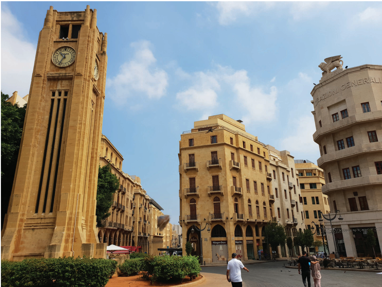
Fig. 5. The clock tower in the centre of Nejmeh Square – Place de l'Étoile, designed according to the plan of Camille Duraffourd, in 1926. The tower designed by Mardiros Altounian in 1934, destroyed in the 1970s, is a careful recent reconstruction of the original height and historic detail. In the background renovated, preserved tenement houses from the 1930–1940s

Il. 5. Wieża zegarowa w centrum Nejmeh Square – Place de l'Étoile zaprojektowanego zgodnie z planem Camille'a Duraffourda w 1926 r. Wieża, powstała oryginalnie według projektu Mardirosa Altouniana w 1934 r., została zburzona w latach 70. XX w. Obecna jest dokładną rekonstrukcją z odtworzeniem gabarytów i historycznego detalu.