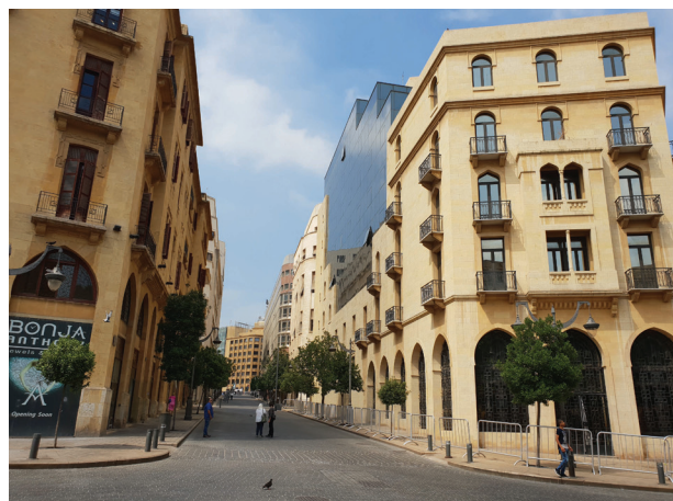
Fig. 6. Parliament Street. One building with a façade fully composed of glass, which resembles the 1990s aesthetics and contrasts with the rest of the street of coherent and unified stone façades

Il. 6. Parliament Street. Budynek w pierzei ulicy zaprojektowany jako obiekt ze szklaną fasadą utrzymaną w estetyce lat 90. XX w., kontrastującą z pozostałą częścią ulicy o ujednoczonej estetyce z fasadami o kamiennych okładzinach na elewacjach