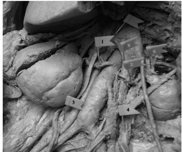
Fig. 1. Arteries anomaly, Courtesy of Chair of Anatomy 1 – right renal artery, 2 – left renal artery, 3 – right common iliac vein, 4 – left ureter, 5 – left common iliac vein, 6 – left renal vein, l – inferior vena cava

ered with colonic vessels, on the psoas major muscle, lied laterally from the common iliac vessels, without crossing them. Moreover, the left colon artery run directly on the left ureter, which is laterally displaced from the correct position, and which may have caused additional compression and impeded the urine flow even more (Fig 2). During the widened ureter opening we found a stone. After the kidney was cut transversely and dilated, we saw multiple stones as well.