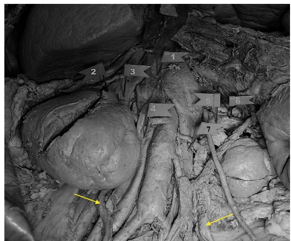
Fig. 2. Veins anomaly 1 – vena cava inferior, 2 – right renal vein branch, 3 – right renal vein branch, 4 – right common iliac vein, 5 – left renal vein branch, 6 – left renal vein branch, 7 – left common iliac vein; yellow arrows – ureters (the left – significantly widened along its entire length)