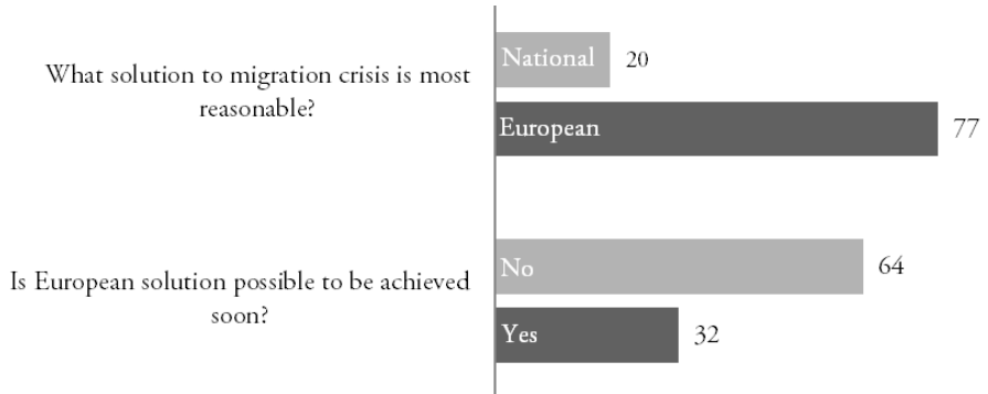
Chart 3. National or European solution of the migration crisis?

Citizens of this state expected politicians to make bold decisions and take effective measures to resolve the crisis, mostly on European level. Simultaneously due to strong opposition of some member states of the EU most Germans were sceptic about possibility of swift decisions on the matter (see chart 3). It was an option sturdily endorsed by A. Merkel, however she did not manage to convince her European partners to it.