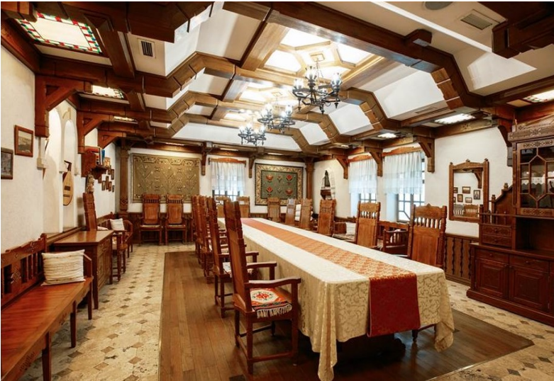
Figure 3. The Room Casa Mare