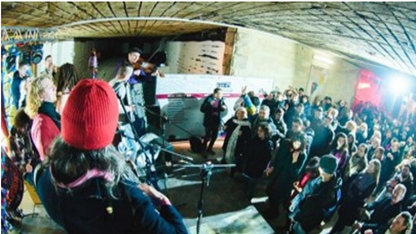
Figure 5. Underland Wine & Music Fest