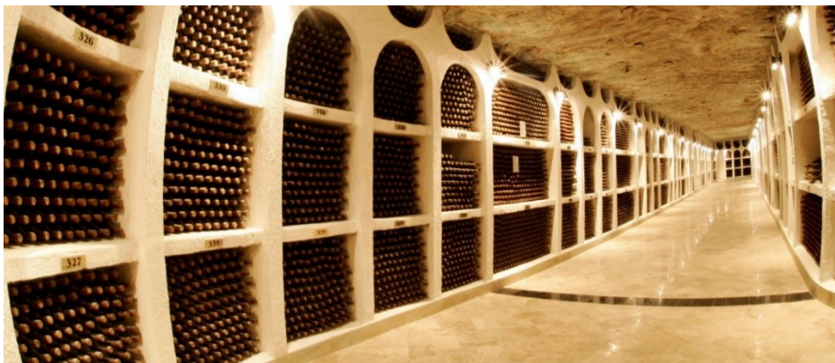
Figure 1. The Underground Complex

Though being located under the whole town of Cricova, the galleries represent a real underground town with streets, traffic lights and road signs. The streets are named according to the name of the wine that is kept in the adjacent niches: Cabernet, Dionis, Feteasca, Aligote, Sauvignon, etc.