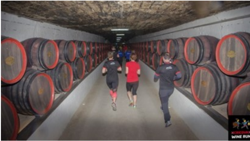
Figure 4. Cricova Wine Run