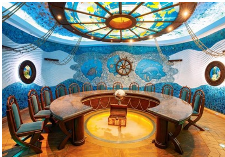
Figure 2. The Bottom of the Sea Room

V. The Room Casa Mare – the place that bears the name of the most beautiful room of a traditional house in the rural area of Moldova (Figure 3). The room is decorated with oak furniture and national motifs. The rustic atmosphere predominates in this room due to the wooden ceiling with beams, which creates the impression of antiquity.