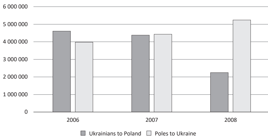
Fig. 2. The Ukrainian-Polish border crossing in 2006–2008

Visa regime liberalisation, and subsequently the introduction of a visa-free regime at the EU-Ukraine border at that time, became one of the most important areas for EU-Ukraine interaction through the mediation of the International Organization for Migration (IOM). IOM assisted the Ukrainian authorities in their dialogue with the EU on visa regime liberalisation and has so far supported the implementation and application of best practices in various areas: migration management, readmission, document security, etc. In order to develop contacts between citizens of Ukraine and EU Member States lay the foundation for the future introduction of a full visa-free regime for Ukrainian citizens between Ukraine and the European Union, the Visa Facilitation Agreement (VFA) was signed on 18 June 2007, which entered into force on 1 January 2008. The provisions of the Agreement set preferences for all categories of Ukrainian citizens in terms of visa fees (EUR 35) as well as the duration and simplification of visa procedures for certain categories of Ukrainian citizens (Uhoda pro sproshchennya oformlennya viz 2008). It should be recalled that visa waiver for EU citizens was made on a voluntary basis back in 2005.