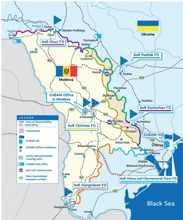
Fig. 1. EUBAM's Offices in Ukraine and the Republic of Moldova

Note: Conflict Resolution, 2017, EUBAM contributes towards the peaceful settlement of the Transnistrian conflict, http://eubam.org/what-we-do/conflict-resolution/ .