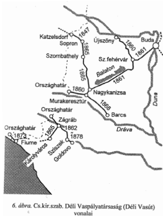
Figure 2. The railway lines of the Free Imperial, Royal Southern Railway Company (Southern Railway)