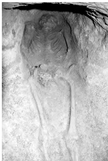
Fig. 3: Inhumation grave excavated in 2014.