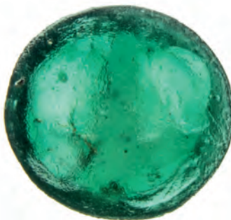
Pl. 5/9. Ring no. 1, gem depicting Isis and Serapis.