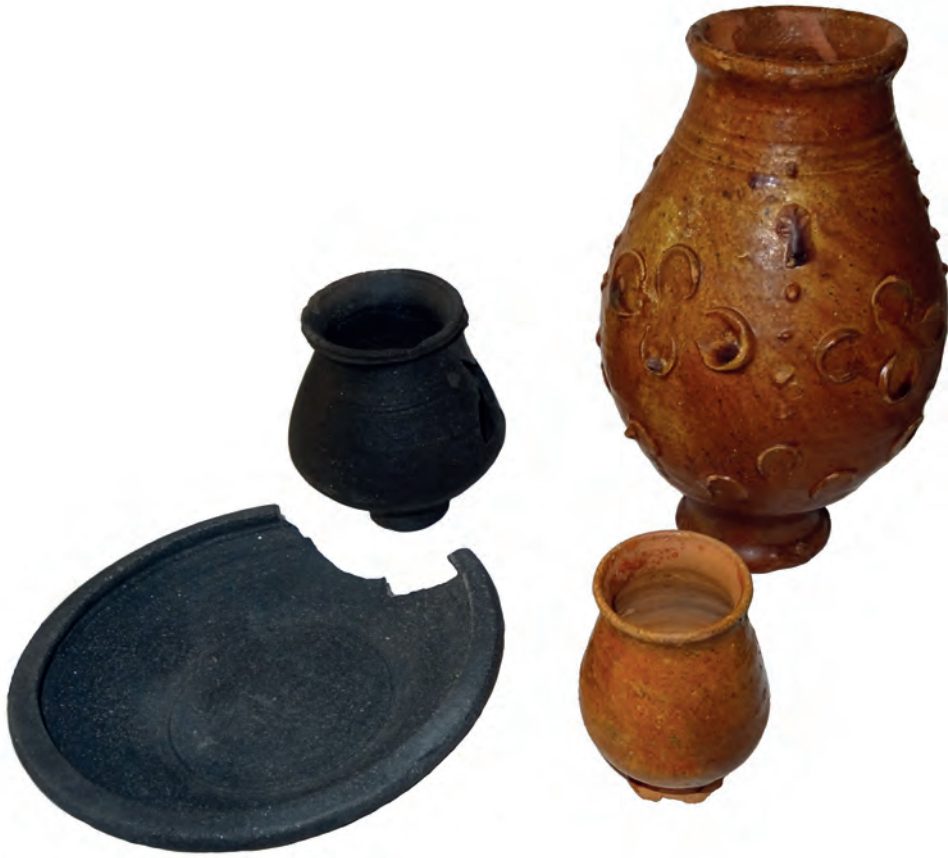
Pl. 5/3: Rusovce-Gerulata, 2014 female burial. Pottery assemblage.