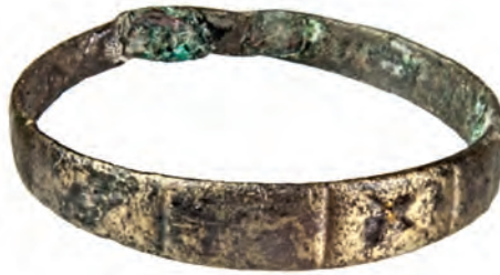
Pl. 5/10: Rusovce-Gerulata, 2014 female burial. Ring no. 2.