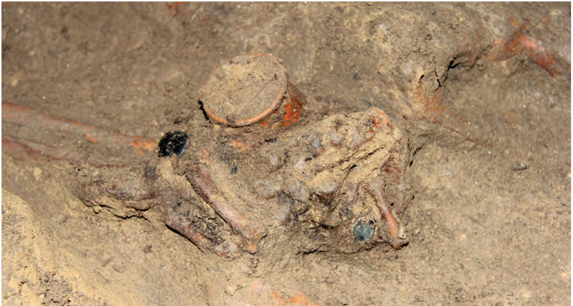
Pl. 5/1: Rusovce-Gerulata, 2014 female burial. Detail of folded hands (photo by M. Pros).