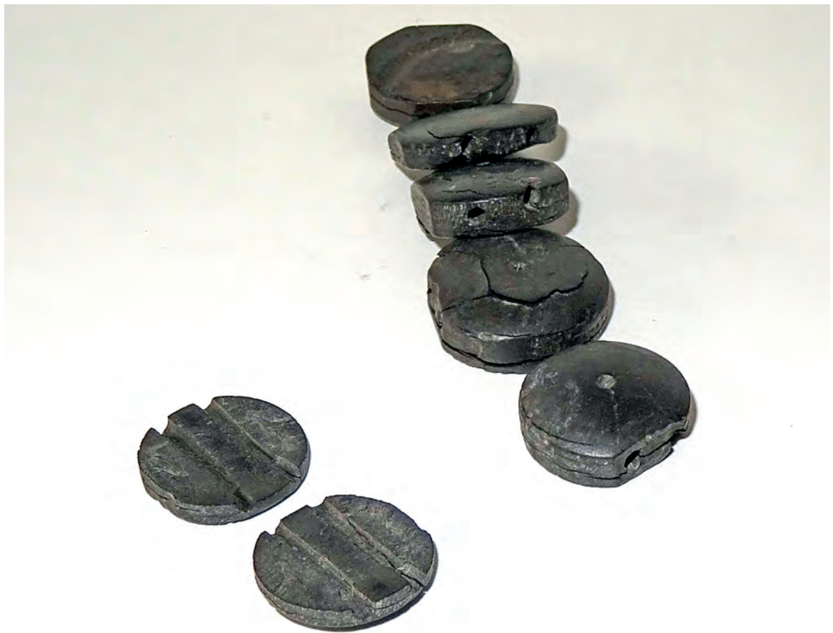
Pl. 5/2: Rusovce-Gerulata, 2014 female burial. Bracelet from coal substance (jet?) composed of seven disks with perforations.