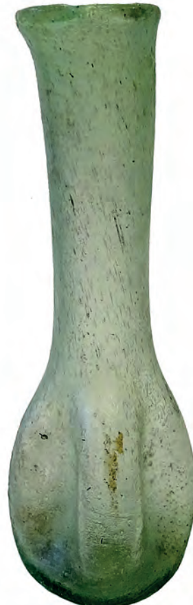
Pl. 5/6: Glass flacon (photo by R. Schmidt).