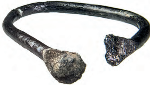
Pl. 5/11: Rusovce-Gerulata, 2014 female burial. Ring no. 3.