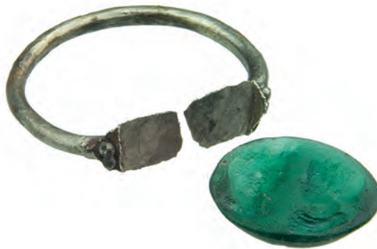
Pl. 5/8: Rusovce-Gerulata, 2014 female burial. Ring no. 1 (photo by L. Mišurová).