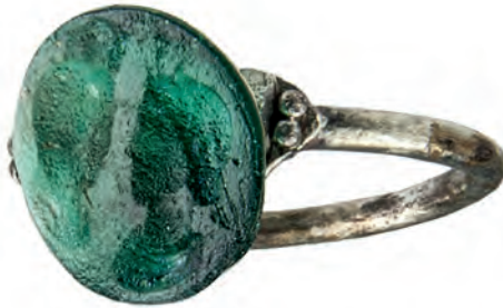
Pl. 5/7: Rusovce-Gerulata, 2014 female burial. Ring no. 1.