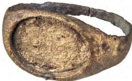
Pl. 5/12: Rusovce-Gerulata, 2014 female burial. Ring no. 4.