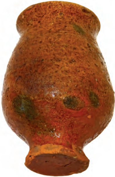
Pl. 5/5: Glazed cup, detail of a twig.