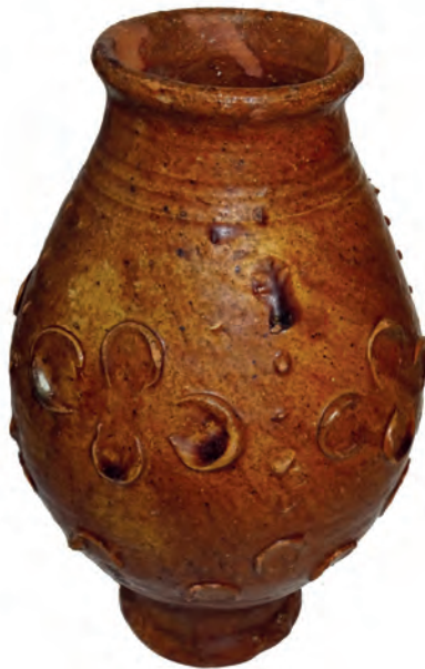
Pl. 5/4: Glazed vase with relief decoration of crescents arranged as a rosette (photo by R. Schmidt).