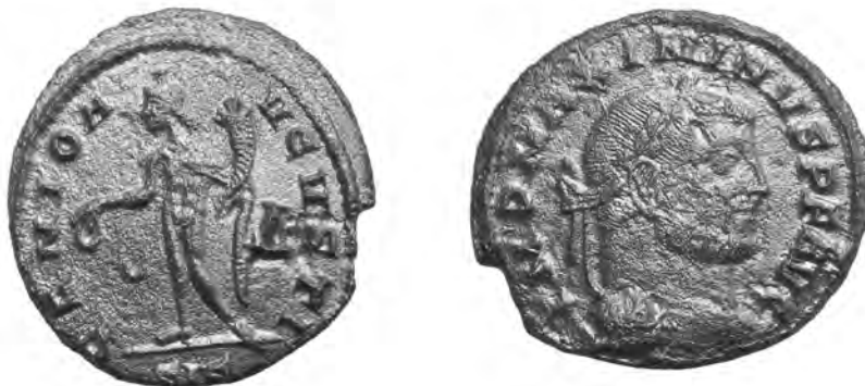
Fig. 4: Coin, bronze, obverse and reverse. Maximinus AD 309–313 (photo by R. Schmidt).