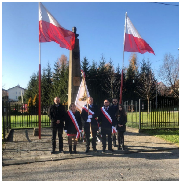
Photo 4. IPA flag post at the monument to Marshal Jozef Pilsudski in Strzyzow, Poland.

St. Michael the Archangel is the patron saint of both the city of Strzyzow and the Idokan Poland Association,