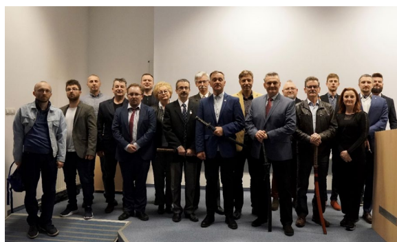
Photo 6. Group of participants of the IPA Symposium, Rzeszów, March 2022.