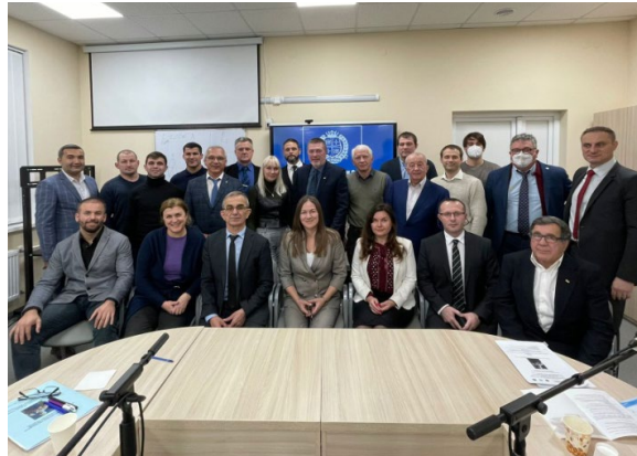
Photo 8. Ongoing, conference in Cherkassy.