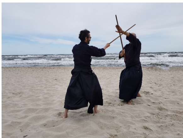
Photo 5. Kenjutsu practice. A fragment of Haka-no tachi.

Tokyo, Japan (6-12.09.2021) – 54 th Annual Conference of the Japanese Academy of Budo. The Academy's headquarters are located inside the Nippon Budokan.