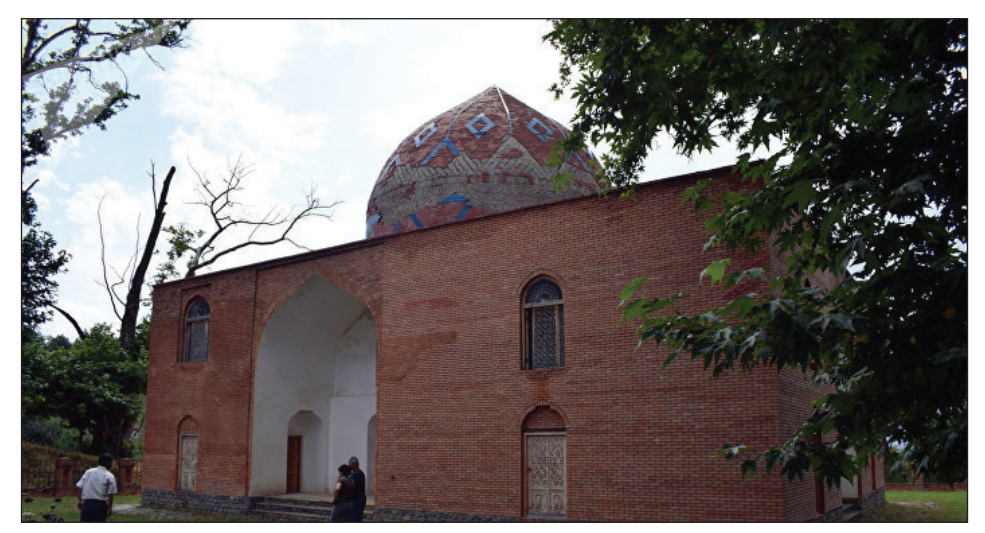
Fot. 2. Mausoleum of Sheikh Juneyd (Gusar region of Azerbaijan)