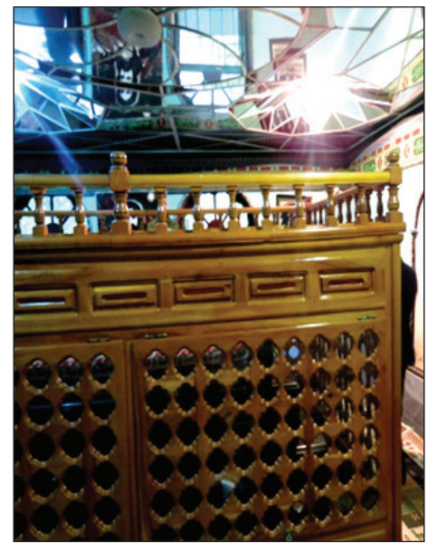
Fot. 3. Tomb of Sheikh Zahid Gilani