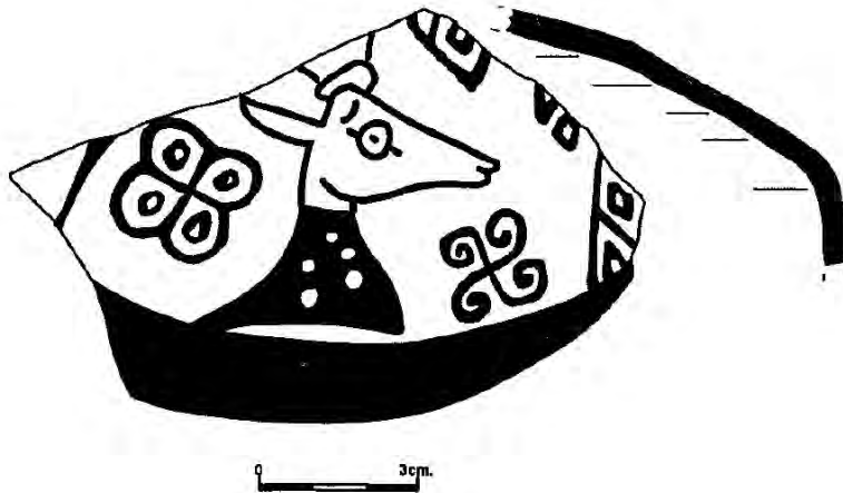
Fig. 2: Potsherd from an oinochoe of Milesian Middle Wild Goat II Style, found in Mezaḏ Hashavyahu (after FANTALKIN 2001, 87–88, Fig. 31:6*).

The result of these objective and subjective forces is the much higher archaeological visibility of elites. In the historical discourse, the Gorgon shield from Karkemish (WOOLLEY 1921, 128, Pl. 14) or the gold leaf helmet discovered on the bottom of Haifa Bay (HALE – SHARVIT 2012) inevitably take on a more important role than the East Greek pottery from the small fortress at Mezaḏ Hashavyahu (FANTALKIN 2001, 74–97; Fig. 2 ) or the obscure bronze sheath for the base of a statuette, said to be from Memphis (JEFFERY 1961, 355, 358, Pl. 70:49).