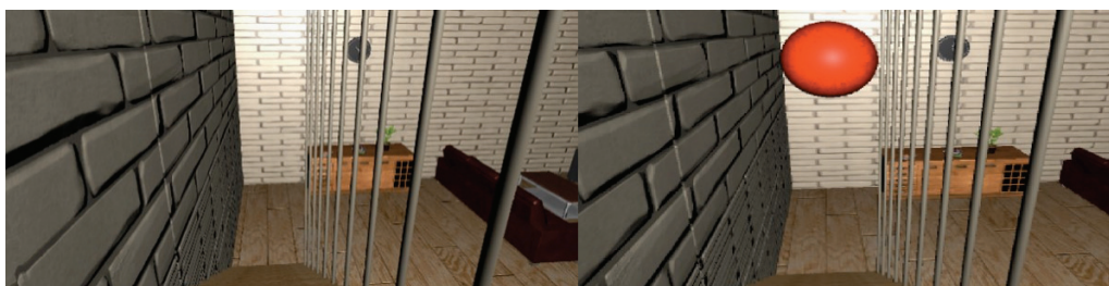
Fig. 1. The scenery of the test: without and with the warning signal

The study was performed using a measurement platform (WinFDM-S, Zebris, sample frequency 100 Hz, 2560 extensometer sensors, sensors area: 34 cm × 54 cm), and a VR HTC Vive headset. The VR application was prepared in the Unity 3D system and consisted of a simple scenery. In the application, the avatar (facing the stairs) was placed on the floor near the stairs. The scenery is presented in Fig. 1.