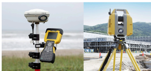
Fig. 1. Modern GNSS and TLS equipments.