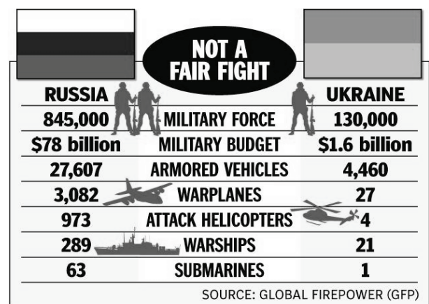
Fig. 2. Comparison of military strength between Russian Federation and Ukraine.

By making attempts to compare military strength potentials between the Russian Federation and Ukraine, it has to be stated that at this very moment, the Russian Federation has bigger potential – Fig. 2.