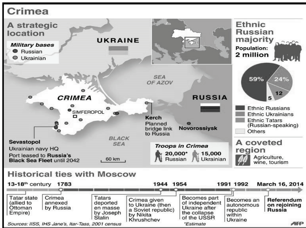
Fig. 3. Crimea in a historical and political perspective.