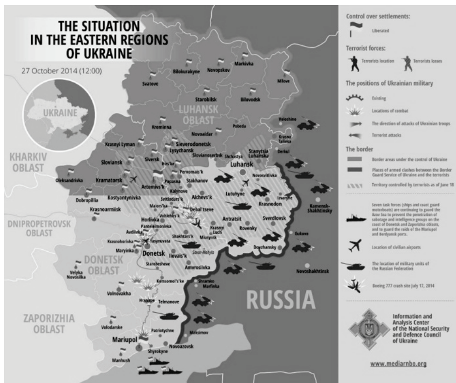
Fig. 4. Current borderline of eastern Ukraine.

Nonconformity to bequests in the Minsk Agreement, and the attempt to force to accept the conditions of conducting conflict imposed by Kremlin is the current policy imposed by Moscow.