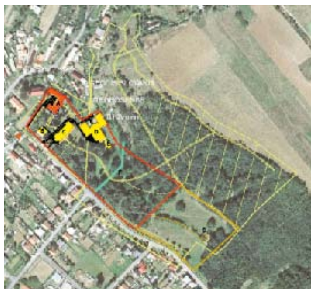
Il. 3. A Comparison of the status of park in 1868 and current status of park in Dolná Strehová [2].

Some the original trees have been preserved at the main entrance of the manor house ( Tilia cordata , Aesculus hippocastanum ). The composition of other woody plants is not legible and only a minimum of trees have been maintained. An inventory created in 2014 recorded 473 trees, included 443 deciduous trees, 30 individual conifers and 13 shrubs in the park (Straňáková, 2015). The species composition of plants consists of mostly native species, the rare species of trees are not maintained. Overall, there are 13 species. The most abundant tree species are Acer campestre (32.4%), Thuja occidentalis (20.6%) and Fraxinus excelsior (18.1%) 10 . Coniferous trees ( Thuja occidentalis ) come mainly from adjustments of park in the 70-80 years of the 20th century. The species composition shows a lack of skeletal long-lived species of trees. Based on the age structure of remaining trees it is evident that most of the of trees in the park are not from the original composition. Up to 35.4% of trees are aged 20-40 years, trees older than 100 years are represented as only 2.5% ( Tilia cordata , Aesculus hippocastanum , Platanus acerifolia ) 11 .