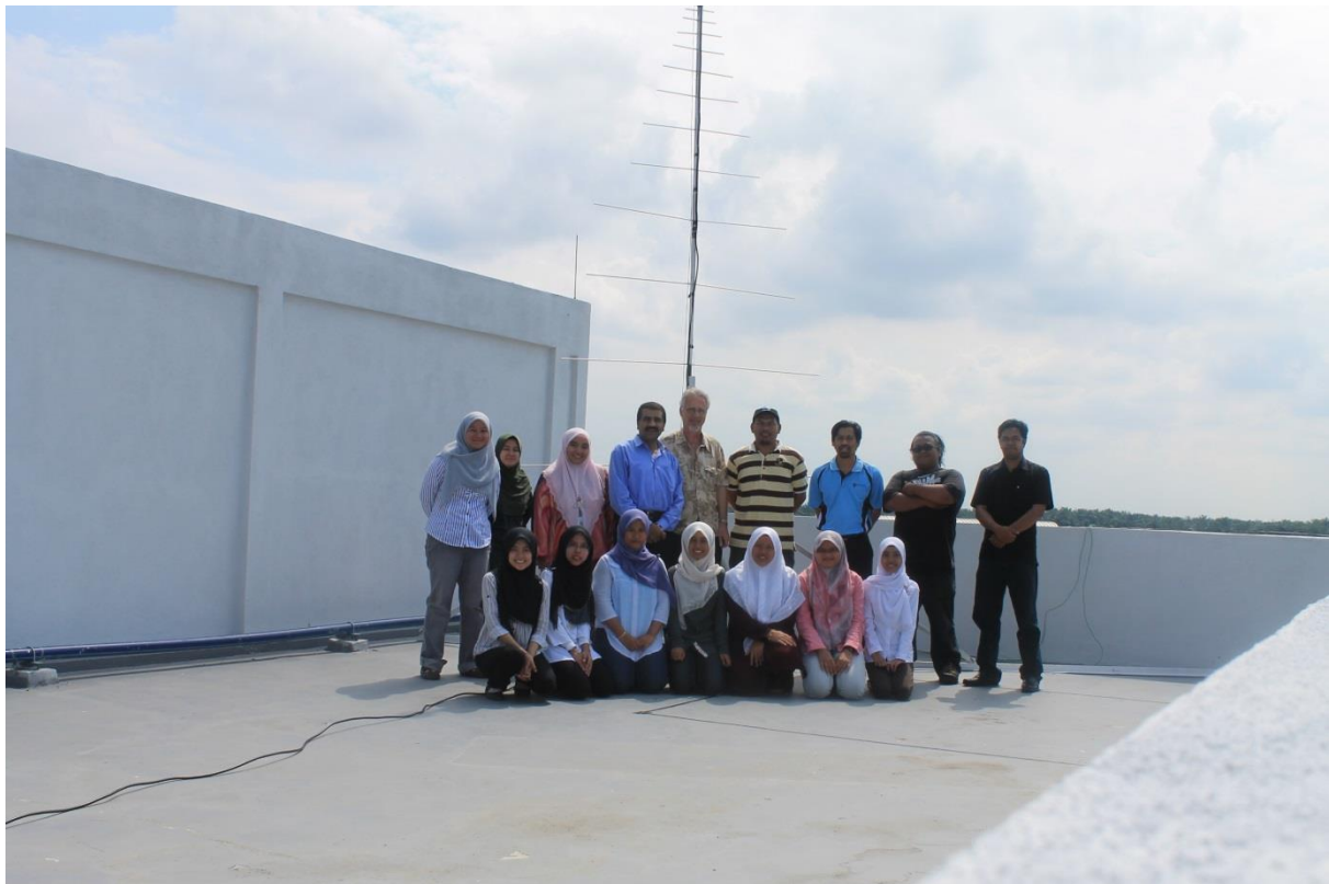
Figure 2. Assemblies of LPDA at National Space Centre, Banting, Malaysia.