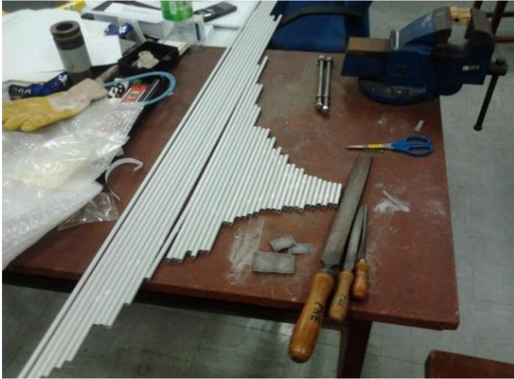
Figure 1. Preparation of construction of LPDA.