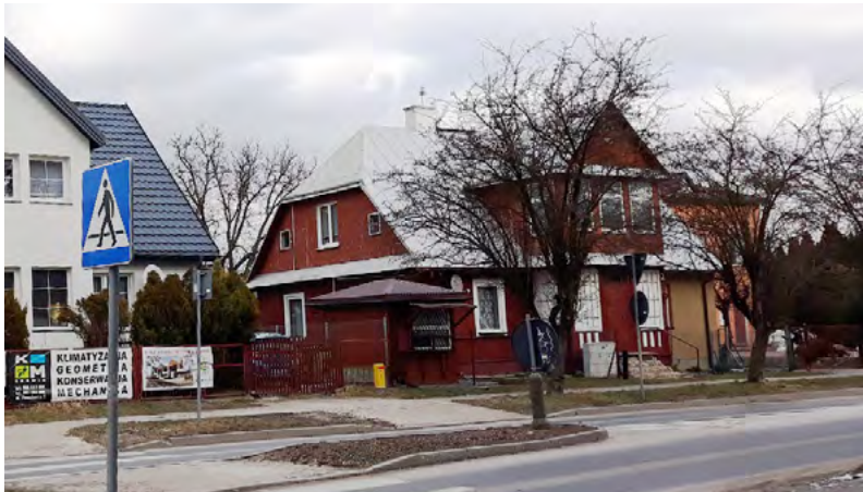
Fig. 4. Wooden residential building, Świętego Piątka 1, its original character has been tarnished by decontextualizing finishing with insulation and plaster covering; moreover, it has been hidden behind a great number of billboards and outdoor advertisements; a roundabout area between Świętego Piątka St. and Lipsa St.