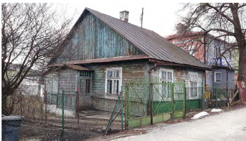
Fig. 7. Wooden residential building, Świętego Piątka 14

The building under the following address differs from the other examples quite substantially in terms of its proportions and the location of a porch which is characterized by numerous divisions of segments of three window panes. It comes from the 1920' and it used to belong to the family of Stopa. Its narrow frontal side has got two white-framed windows, facing the street.