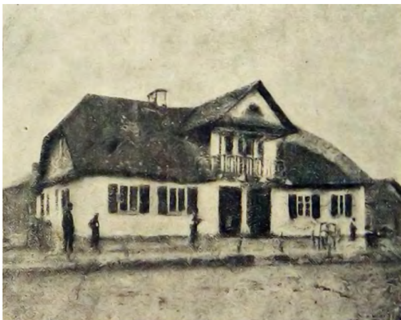
Fig. 3. A house in Nowa Osada, author: Wł. Krzaczyński, Teka Zamojska. Rok III. Nr 3 (Marzec 1920, p. 45)