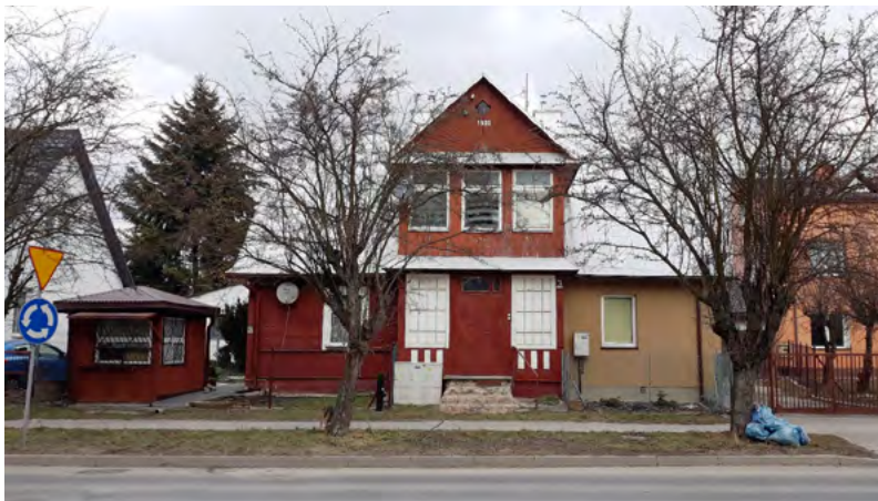
Fig. 5. Wooden residential building, Świętego Piątka 3

The building is situated at the opening of Świętego Piątka St. The building is characterized by a hipped-gable roof, wooden finishing of the wall patterned primarily in horizontal planks from the lower window line right up to the overhang. Bottom part, between the windows and a concrete band, is clad with vertically aligned brown wooden planks. Similarly to the Świętego Piątka 1, the main frontal axis is accentuated with a protruding two-storey porch structure with a radially arranged area of a tympanum. The porch has got two lines of white-framed wooden windows, three in each line. The entrance is positioned symmetrically and elevated for five steps. The building comes from 1933 and the date is placed in the middle of the tympanum. Lower line of windows installed in the porch has a different division into segments (sixteen segments per each window). At the moment, the building is partially insulated which distorts its symmetry.