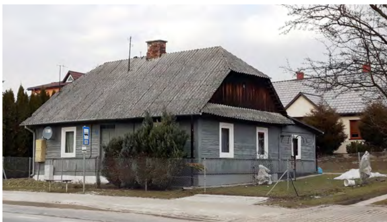
Fig. 6. Wooden residential building, Świętego Piątka 7

The Świętego Piątka 7 wooden house has got a simpler form than the previous ones and many characteristic features similar to the ones described earlier. The ground floor building with a hipped-gable roof, with a line of one-paned, white-framed windows placed symmetrically on both sides is painted in grey. There is a possibility that the window frames might be made of plastic which is another violation of the house's original appearance. The proportions of the building are steady and harmonious. The building is topped with a brick chimney placed centrally above the entrance.