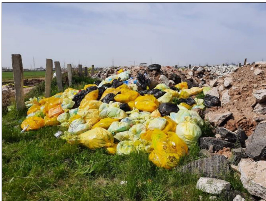
Figure 2. Illegal dumping of medical and biological waste in Dobroiesti commune, Romania, in 2020

the recommendations of STANAG 2982 “Essential field sanitary requirements” – compliance with sanitary and hygienic requirements in the field).