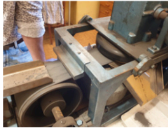
Fig. 2. Magnetic separator – vibrating material feeder [own elaboration]

Rys. 2. Separator magnetyczny – podajnik wibracyjny nadawy