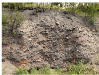
Fig. 1. Mine heap from which the test sample was taken