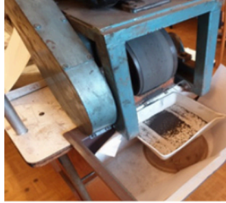
Fig. 3. Magnetic separator – reception of diamagnetic material [own elaboration]

Rys. 2. Separator magnetyczny – podajnik wibracyjny nadawy