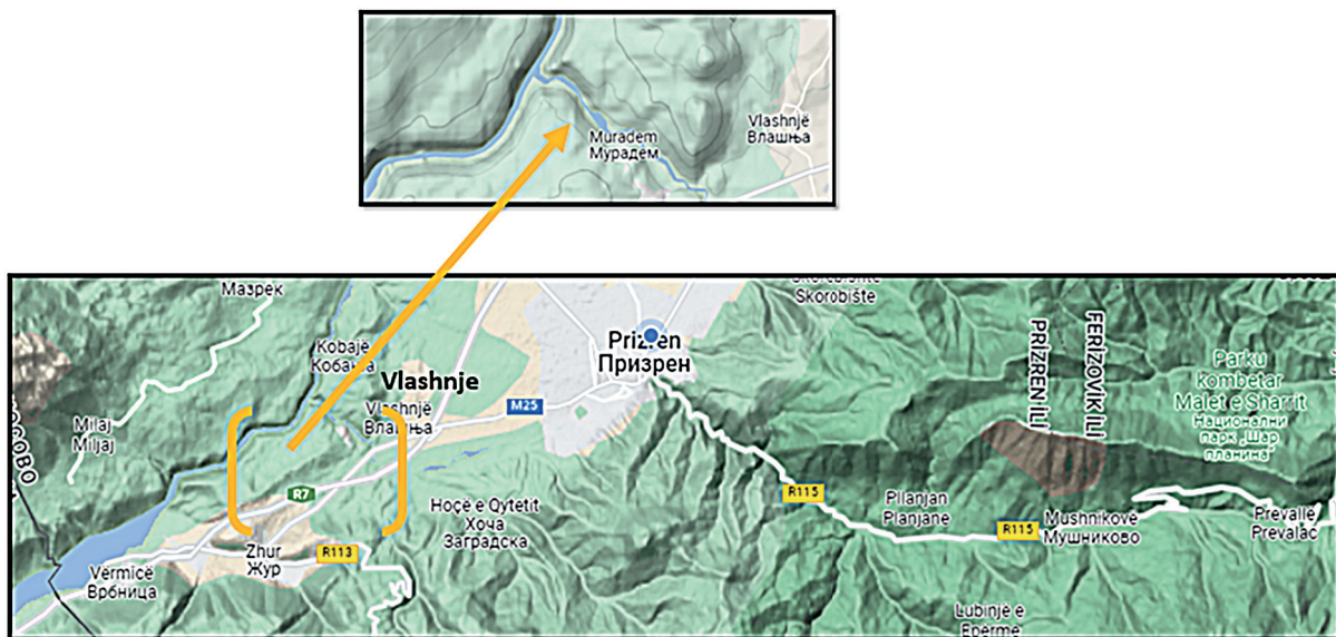
Figure 1. Map showing the monitoring stations in the Lumbardh stream and Vlashnje region

T, pH, EC and Tur were measured in situ in the water samples taken. A portable device TURBIQUANT Model 1100 T was used for Tur measurement. pH, T, EC and TDS were measured with the portable YSI Multiparameter (YSI Incorporated, 2009) device. Major ions, heavy metals, DO, BOD, COD, TSS and TOC amount in the water samples taken were analyzed in laboratory. In the laboratory, some of the water samples were filtered on the day of sampling. 8 metals (Cr, Mn, Ni, Cu, Zn, Cd, Pb and Fe) in filtered water samples were measured in the laboratory with Perkin Elmer AA30 model atomic absorption spectroscopy. 6 ions ( \text{NO}_3^- , \text{NO}_2^- , \text{NH}_4^+ , \text{PO}_4^{3-} , Total Phosphorus, \text{SO}_4^{2-} ) were measured by Shimadzu, CTO-20 AC SP (Ion-Chromatograph). DO was made by the Winkler method (Carpenter, 1965) and the SCHOTT Titroline easy M2 titrator was used for titration. TOC analysis was performed with the GE Sievers 900 TOC analyzer. The determination of BOD, COD and TSS were measured with Secomam pastel UV.