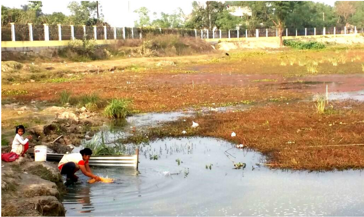
Figure 1. The Motijheel lake water is used for regular household chores.