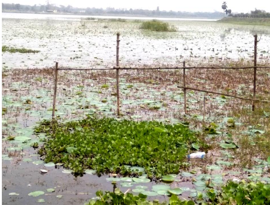
Figure 3. Expanse of algal bloom on the surface of Motijheel Lake. The lake is covered by aquatic weeds, floating plants and marshy plants.