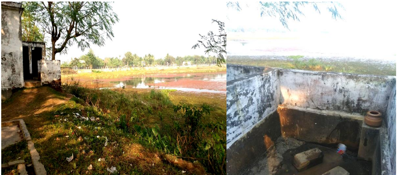
Figure 2. Human and animal excreta are discharged directly into the lake without prior treatment.