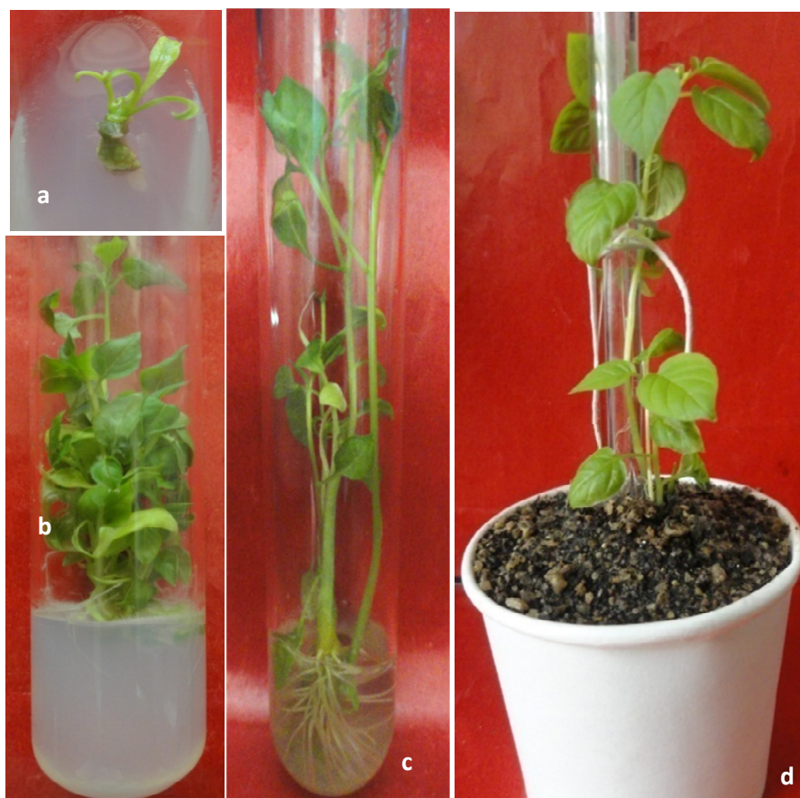
Plate II. In vitro shoot induction, proliferation and acclimatization from nodal explants of Physalis minima L. a) Initiation of direct multiple shoots from nodal explants on MS + 2.0mg/l 2,4-D + 1.0mg/l Kn. b) Multiple shoot formation from in vitro derived nodal explants on MS + 2.0mg/l 2,4-D + 1.0mg/l Kn after 15 days. c) Root induction on MS + 1.0mg/l IBA. d) Acclimatized potted plant.