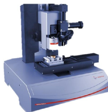
Figure 2. Anton Paar TriTec Ultra Nano Hardness Tester (UNHT)