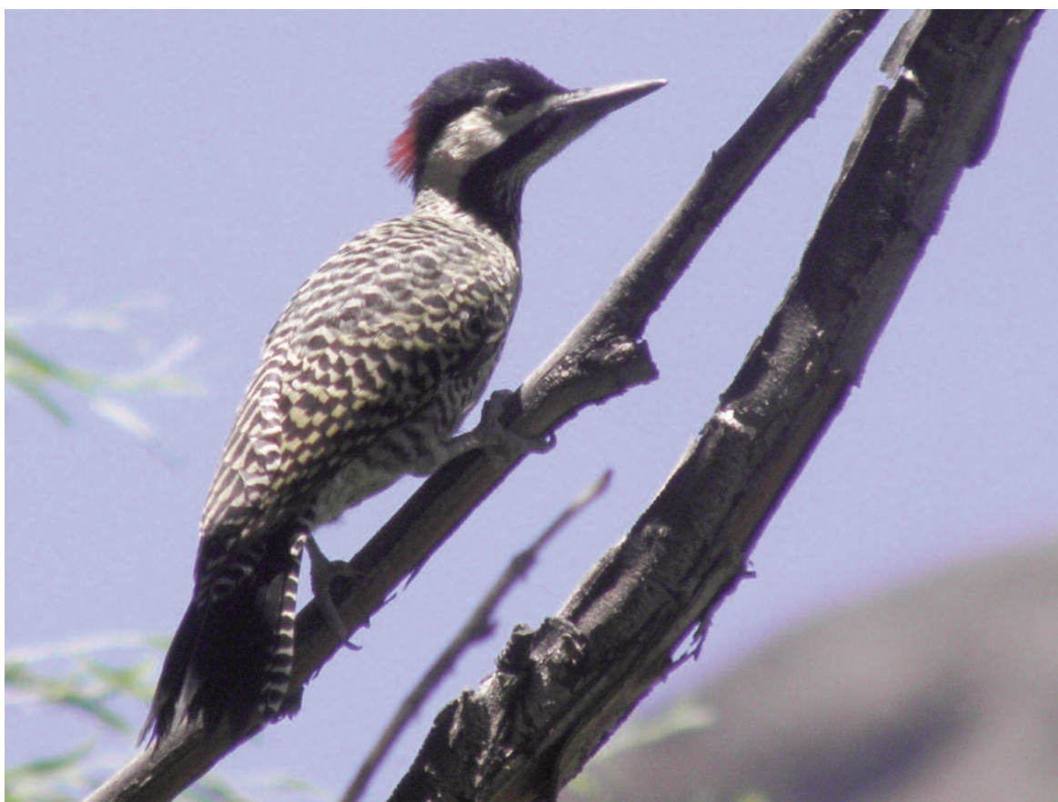
Figure 3. Adult specimen of Green-barred Woodpecker, Colaptes melanochloros