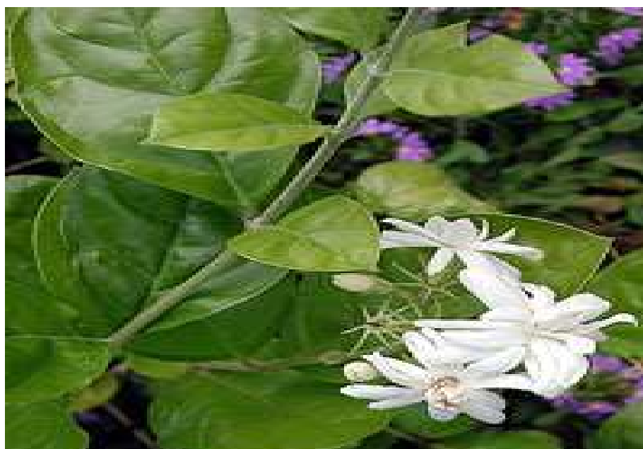
Fig. 1 Morphology of Jasminum sambac Linn. (Whole Plant) and Leaf

The methods carried out in the present research work namely .The pharmacognostical and physicochemical characteristics of Jasminum sambac Linn , which could be used in identification and to distinguish the plant material, were determined and established. The ethnobotanical study of plant material reveals about its potential to cure various ailments. The present study may be useful information with regards to its, ethno- pharmacological potential, screening and isolation of phyto-constituent to carrying out further research.