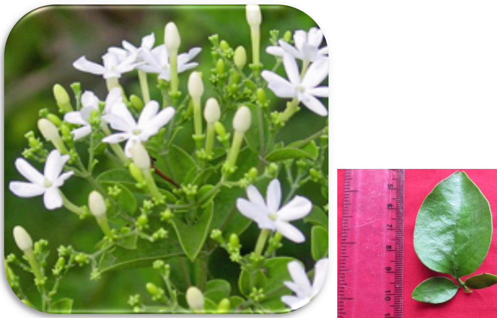
Figure.1: Morphological features of Jasminum auriculatum Vahl. (Whole plant) and Leaf

Jasminum auriculatum is a scandent, pubescent or velvety shrub with grey -pubescent branchlets having shiny minute lateral leaflets simple central leaflet broadly ovate, acuminate or rounded, main nerves few inconspicuous, petioles very short. The plants produce numerous star shaped white scented flowers loosely arranged corolla lobes 5-8; fruits globose, black ( Figure.1 ).