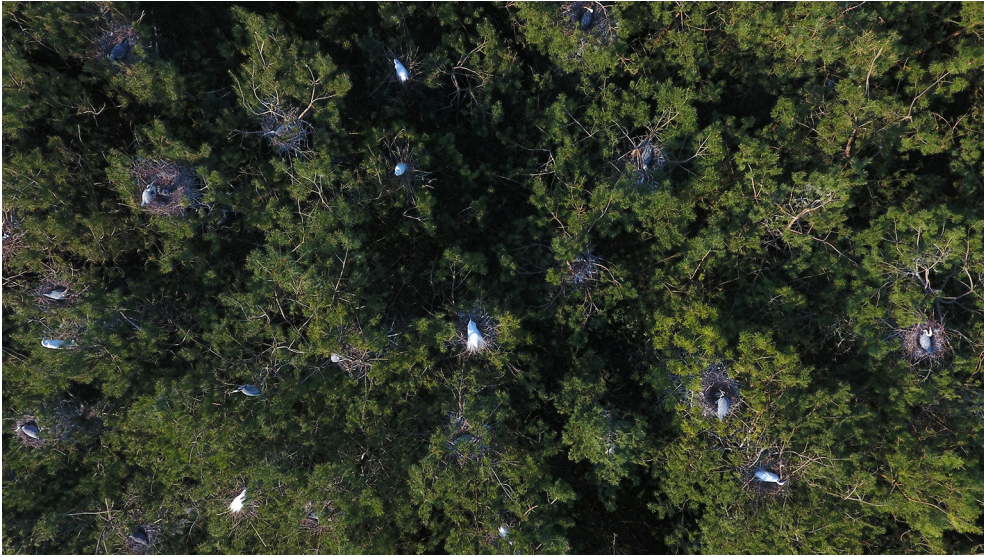
Phot. 2. Mixed colony of the Great Egret and Grey Heron on trees at Lake Kruklin in 2018 – Kolonia mieszana czapli białej i czapli siwej na drzewach nad jez. Kruklin w roku 2018

authorities. Flights within the border zone were conducted under the permits issued by proper units of the Border Guard. The drone operator had a licence for using UAVs of the weight exceeding 0.6 kg (VLOS, licence number: PL.39050.UAV).