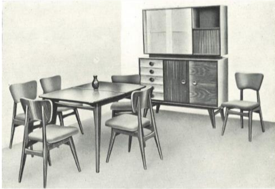
Figure 1. Dining set [Zjednoczenie Przemysłu Meblarskiego 1960]

The number of meters per person had been limited (the living standards for M-1, M-2, M-3, etc.), so it was necessary to design new kind of furniture. The large, expensive furniture sets for dining rooms, offices and bedrooms did not fit in the newly built small apartments. Therefore, they needed to be redesigned, and furniture sets were often replaced with single, multi-functional pieces of furniture, like the highly popular coffee table (Fig. 1), whose height was adjusted to either chairs and high armchairs, or lower armchairs and sofas.