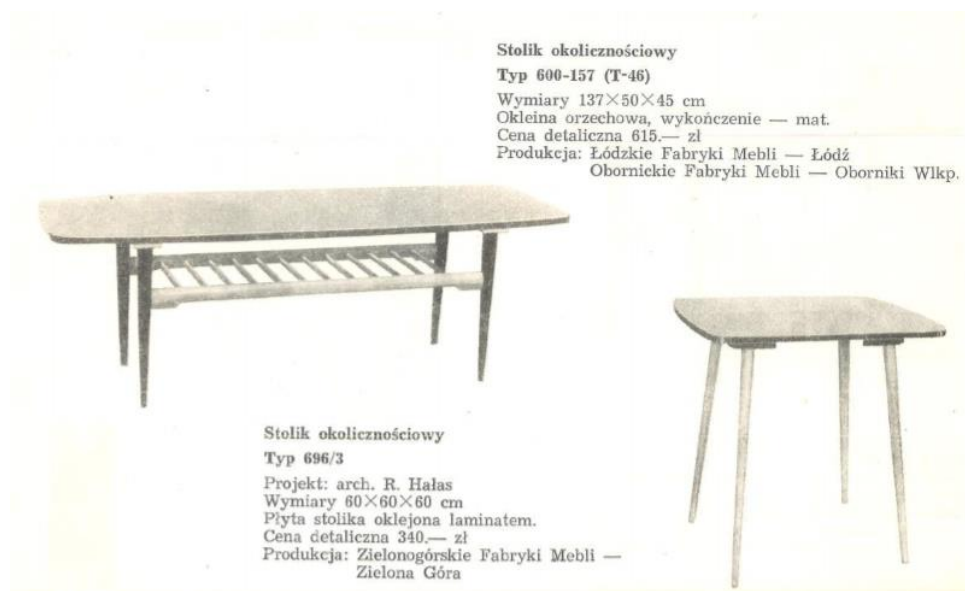
Figure2. Coffee tables [Meble do Małych Mieszkań 1966]

The number of meters per person had been limited (the living standards for M-1, M-2, M-3, etc.), so it was necessary to design new kind of furniture. The large, expensive furniture sets for dining rooms, offices and bedrooms did not fit in the newly built small apartments. Therefore, they needed to be redesigned, and furniture sets were often replaced with single, multi-functional pieces of furniture, like the highly popular coffee table (Fig. 1), whose height was adjusted to either chairs and high armchairs, or lower armchairs and sofas.