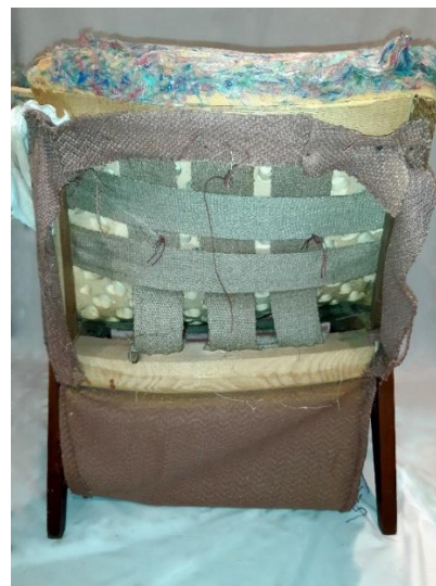
Figure 6. Layers of upholstery of the "Fotel 366/Armchair 366"

The armchair, in spite of the fact of being upholstered, has a very light, wooden frame structure. It's not big: 750 mm high, 640 mm wide, and 680 mm deep, with the height of the seat reaching 420 mm. The armchair has a frame structure with two lateral supports, with a very creative and material-effective layout. Technically, it is made of only 2 subcomponents: a frame