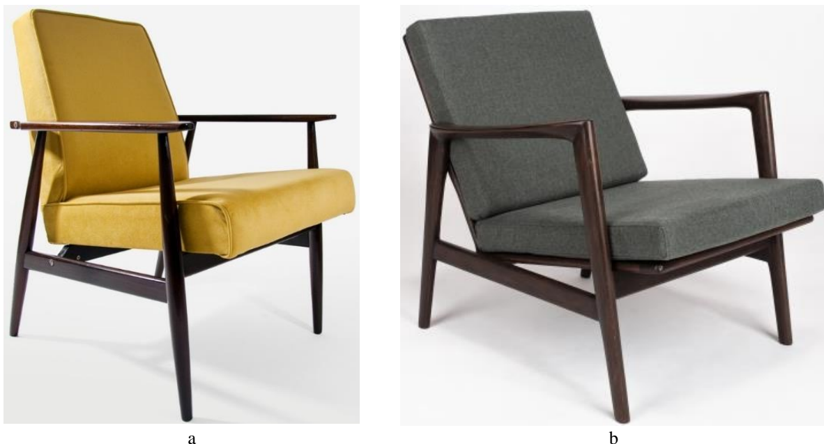
Figure 9. Refurbished Polish armchairs from the 1960s: "Lisek" by Hanna Lis (a) and "Stefan" (b) produced mainly for export

The design of "Fotel 366/Armchair 366" also includes some features of the Scandinavian style. There is a striking likeness between the formal solutions of Chierowski's armchair frame and the armchair by Hans J. Wegner presented in Figure 8a. Both have wooden, exposed legs, are highly functional, and their shape is visually light. On the other hand, the minimalism, simplicity and original design of the "Fotel 366/Armchair 366" make reference to the Bauhaus school of design.