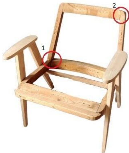
Figure 5. Wooden frame of the supports and the upholstered part with structural nodes marked [ https://www.loftdizajn.pl ]

The Institute of Industrial Design (IWP), that coordinated industrial production, forced the designers to follow certain rules for maximum functionality. "Fotel 366/Armchair 366" is a perfect design for industrial production, masterfully combining the requirements of demand with the expectations of the suppliers, which made it into one of the best-known symbols of the Polish People's Republic. It was created as highly functional and aesthetic, which satisfied the consumers. Thanks to its small dimensions and simple structure (or even austerity) it did not take up too much space and did not dominate it, which made it a perfect addition to small residential interiors, as well as public spaces such as the cafeteria [ https://vod.tvp.pl ]. Its simple structure permitted easy and cheap production, thanks to which a high number of pieces could be produced in a short time. The production was easy, most of all, due to the creative and simplified armchair construction.