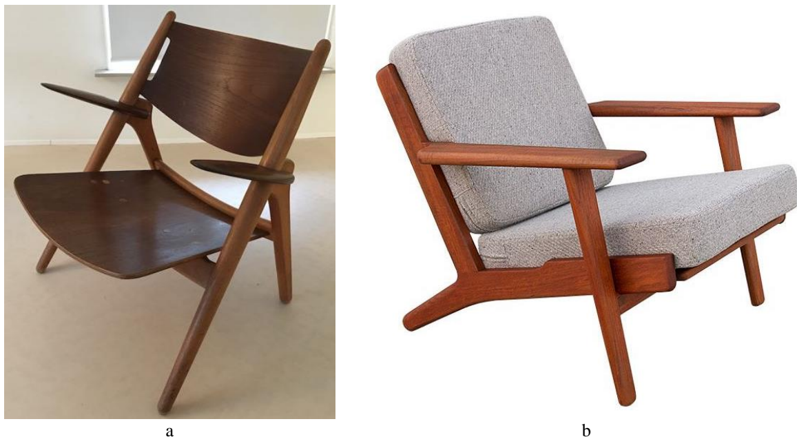
Figure 8. Scandinavian armchairs by Hans J. Wegner: armchair made of solid wood and plywood (a) and "Armchair GE 290" (b)

The "Fotel 366/Armchair 366" has a lot in common with foreign furniture from late 1950s and early 1960s, when it comes to style, structure and materials. Definitely, in the period when it was created, Polish artists drew inspiration from Scandinavian design (Fig.8).