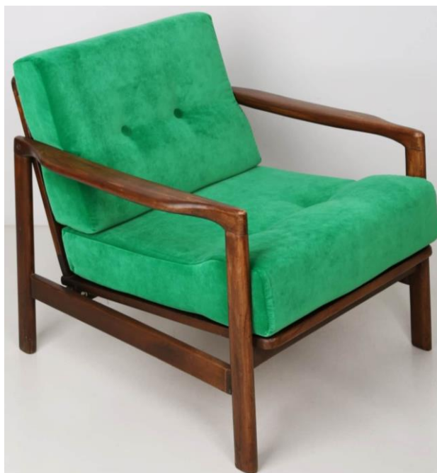
Figure 10. "Bączyk" armchair designed by Zenon Bączyk