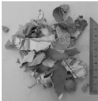
Figure 1. The shredded Tetra Pak material

The tested particleboards were made of industrial pine particles and Tetra Pak packaging. Tetra Pak packages were collected from household waste sorting. The plastic upper part, including opening and closure elements, were removed from the packaging, and the remainings were mechanically shredded using a branch shredder. During shredding, partial delamination of this material occurred. The crushed material was sorted using a 40 mm sieve. Figure 1 illustrates the shredded Tetra Pak material.