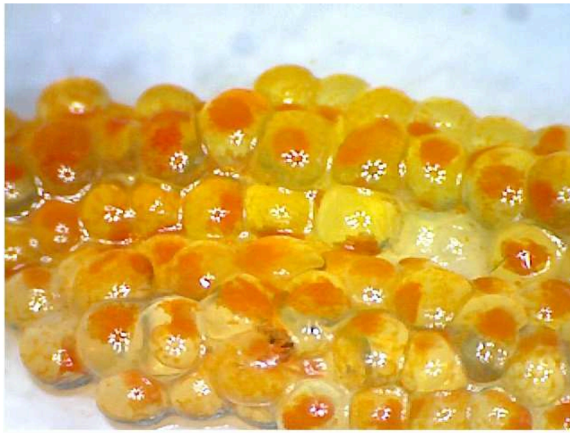
Fig. 3. Eggs of pipefish from the Zaporozhian Reservoir

Pipefish with body length between 9 and 12 cm had gonad which mass was about 0,13 \pm 0,01 g, and the number of eggs ranged from 26 to 65 pieces. Maximum fertility had the female 150 mm long and it reached – 65 eggs. Measurements of eggs reached about 1,2 \pm 0,05 mm. Pipefish eggs have a bright orange color, have a considerable supply of nutrients and a large oil drop, which is located on the periphery of the egg (Fig. 3). Fertilized eggs in the male's brood pouch were very different in shape because of the degree of compression in the brood pouch, but in most cases they were almost spherical. Measurements of eggs on the third day after spawning reached 1,4 \pm 0,24 mm.