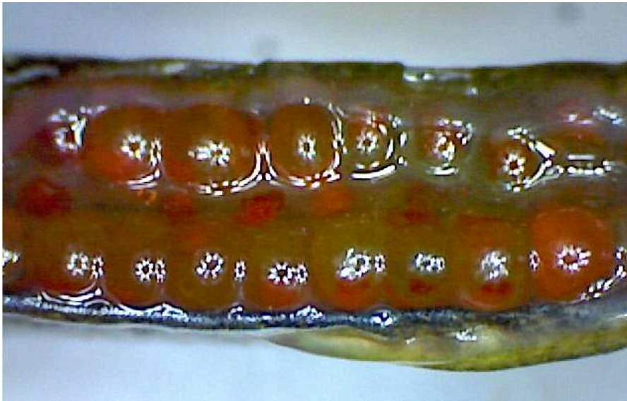
Fig. 2. Eggs of pipefish in the male brood chamber on the third day after spawning

Brood chamber of the male length 120–149 mm contains in average of 54 (range 41 to 66) eggs [16]. After female lays her eggs in the male's brood chamber, the camera shutters grow together, the fertilized eggs become completely isolated from the external environment (Fig. 2).