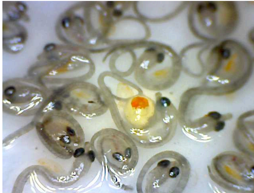
Fig. 5. General view of the pipefish embryos in age of 22 days, removed from the male brood chamber

Researches of 2010–2014, showed that the greatest quantity of pipefish in the Zaporozhian Reservoir was recorded in 2012 and amounted 5.28 ind./100 m 2 of shallow reservoir areas. Biomass of pipefish fingerlings ranged from 0.28 g/100 m 2 (index 2013) to 4.38 g/100 m 2 (index 2012). The average annual quantity and biomass of pipefish fingerlings in the Zaporozhian Reservoir reached 2.77 ind./100 m 2 and 1.82 g/100 m 2 , respectively (Table 1).