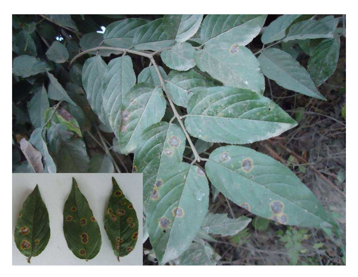
Figure 1. Disease symptoms on leaves of Celtis australis.