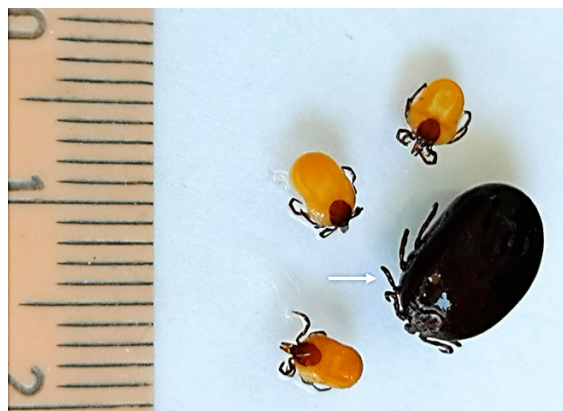
Figure 2. Engorged female of Dermacentor reticulatus (arrow) collected from a dog's head in Radomsko in October 2010 (scale in cm)