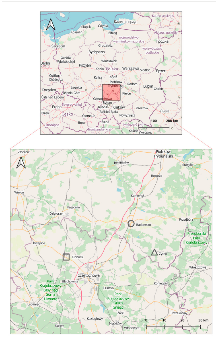
Figure 1. Geographical locations in Poland where Dermacentor reticulatus ticks were found on companion animals in 2010–2014.

O- 51°04'01"N, 19°26'41"E, 223 m a.s.l.; - 50°54'02"N, 18°56'12"E, 239 m a.s.l.; Δ- 50°55'38"N 19°37'39"E, 202 m a.s.l.