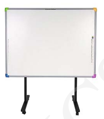
Fig. 1. An interactive whiteboard - Interwrite DualBoard.