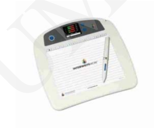
Fig. 2. Wireless tablet Interwite Mobi produced by Interwrite Learning.

The teacher's tablet provides a full, though discreet control over students' work. Due to the fact that the teacher can see answers entered by students on the display, s/he can assess the results immediately upon completing the task and discuss errors with particular students.