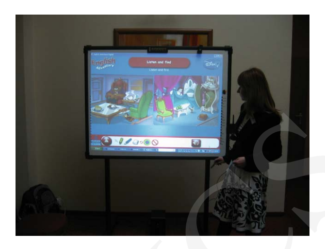
Fig. 3. Working with an interactive whiteboard with educational software.