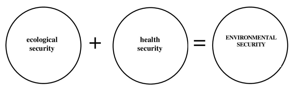
Figure 4. Components of broadly understood environmental security, source: author's own study

adly) perceived environmental security consists of (narrowly taken) ecological security (understood as protection and shaping of the natural environment) and health security (protection and shaping of human health) – see Fig. 4. Although many authors use the term environmental and ecological security interchangeably, this distinction is also possible and correct. After all, such broadly understood environmental security (as ecological and health security) very well fits into its definition previously formulated. It could be supplemented (by the expression in brackets) as a permanent state free (of adverse effects) of threats that violate the dynamic balance in the natural (socio-natural) environment, enabling (positive) ability to maintain it continuously, ensuring the existence, further development (including health and life<sup>7</sup>) and a sense of such state (own definition).