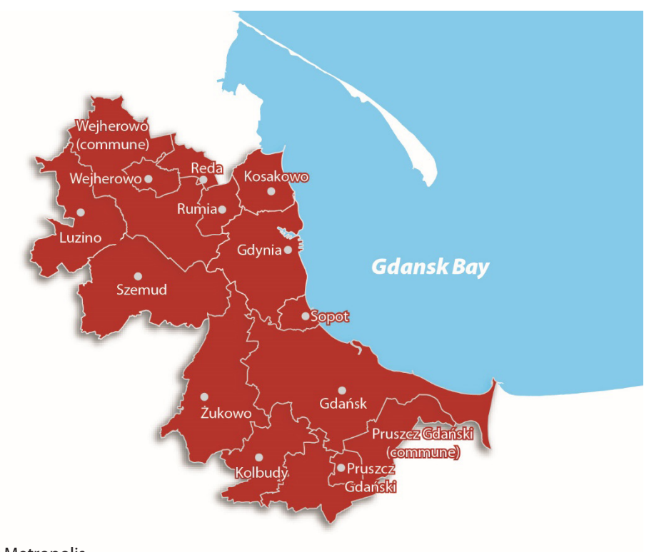
Fig. 1. Tri-City Metropolis.

Questions 1-4 relate to the research already carried out presented in the literature review. Their purpose is to confirm the conclusions of research carried out in other cities. Answers to questions 5-8 complete