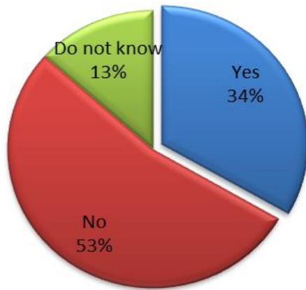
Figure 3. Availability of Secondary School with MET in own jurisdiction

Question 1: What are the merits and demerits of maritime education and training at the secondary level?