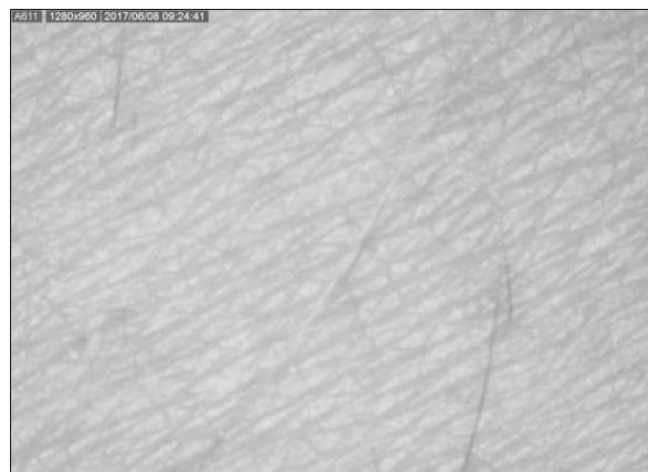
FIG. 1. Skin before the microdermabrasion surgery.