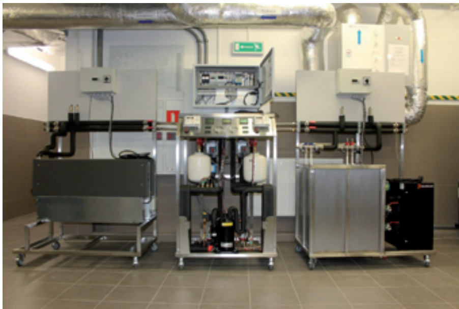
Fig. 3. Didactic air-water type heat pump. Energy source, heat pump and heating system modules