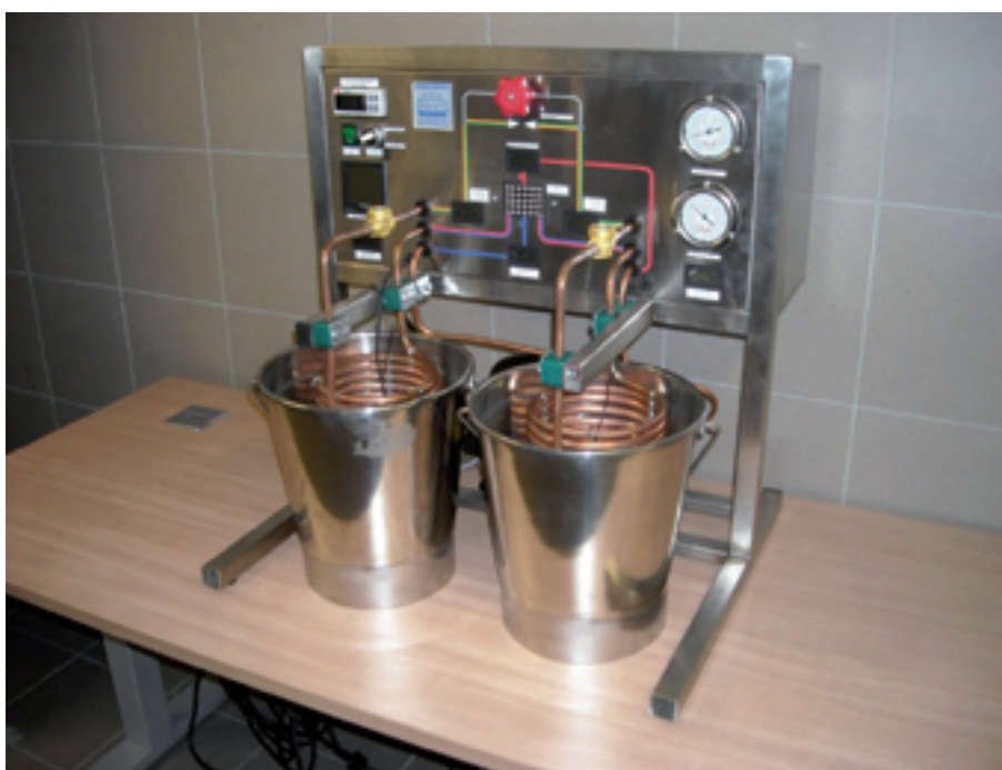
Fig. 4. Didactic heat pump, water-water of the direct evaporation type

The results of the test give the information about: