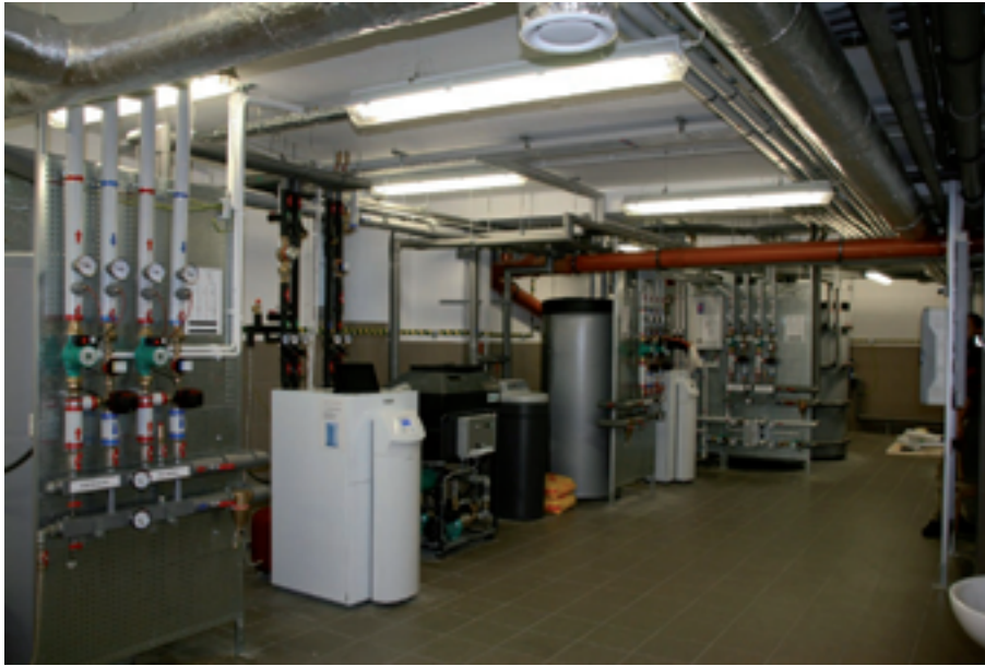
Fig. 1. View of the boiler room with the installed heat pumps