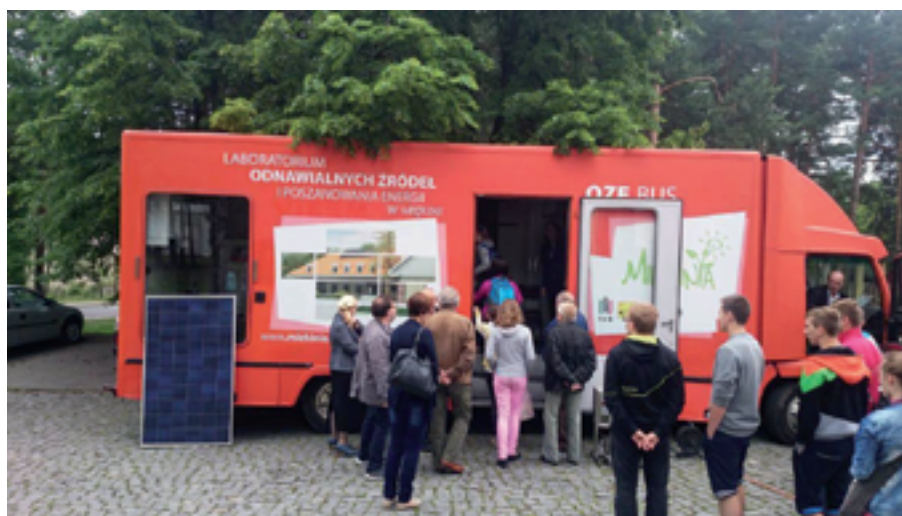
Fig. 6. Mobile RES exhibition

Despite the fact that the Centre in Miękinia has only existed for five years, it has extensive experience in conducting research and the popularization of renewable energy sources.