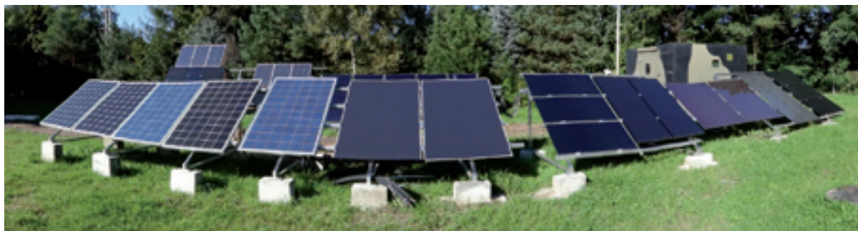
Fig. 5. Research installation for the field testing of different types of PV modules

In the measuring station on the DC side (before the micro inverter) multifunction meters: Nemo D4DC are used for each PV panel to obtain data such as the amount of energy production, actual power, voltage and current of PV panel. To convert energy from direct current to alternating