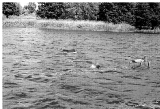
Fig. 4. Tests of a ship capsizing in waves

In 1993 and 1994, the Foundation for Safety of Navigation and Environment Protection performed a series of measurements to show what are the conditions of a ship capsizing in waves. In view of a great number of different parameters influencing the behaviour of a ship in waves, the measurements were limited to wave recordings and determination of the effective wave height as well as the calm water righting lever of the tested model. The tests were performed on one self-propelled, remotely controlled model of a fishing trawler, with two different values of the hull depth. The model was tested with different stability characteristics, different speeds, different headings in relation to the waves near the wave recording probe, until the model capsized. Those results were used to describe a safe curve of righting levers as a function of the effective wave height and to verify the theoretical calculations. The tests were performed by the author of this paper with Ryszard Kaminski, Janusz Wolniak and Jan Bielanski.