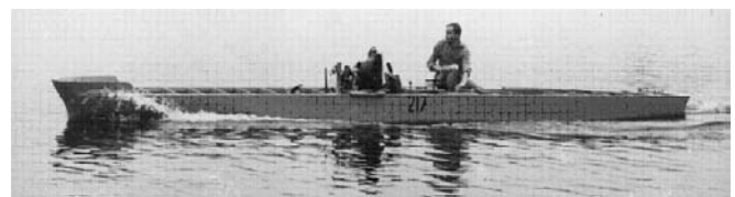
Fig. 2. Landing craft investigations

The Naval Shipyard in Gdynia built altogether 17 medium size landing craft, including 4 ships for India in 1974-1976 and additional 4 in 1984-1986; 4 ships for Iraq in 1976-1979 and 4 for Libya in 1977-1979, and 1 for Yemen in 2002. During the commissioning of ships in Gdynia, the Iraqi officers ordered commemorating medals with a Gdansk medallist. There is a medal for the first ship (ATIKA 1976), for the second ship (JENADA 1977) and for the fourth ship (NOAH 1979). No medal was ordered for the third ship GANDA in 1978. The ships received consecutive side numbers from 82 to 85. When a Shipyard delegation was in Iraq in 1989 to discuss the conditions of repair of those ships, the Iraqi fleet had only three ships and the last, NOAH, had number 84. It turned out that the third ship, GANDA, the one without the commemorating medal, had been destroyed by mistake by own air force. The medals were a good talisman for the ships. But in August 1990 the invasion on Kuwait took place and five months later the “Desert Storm” operation began. A rocket attack of British helicopters on ships stationed in the Umm Qasr harbour completed the destruction. Repairs were no longer needed.