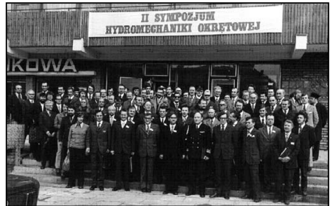
Fig. 6. 2nd Symposium on Ship Hydromechanics

Apart from the Ship Hydromechanics, in connection with