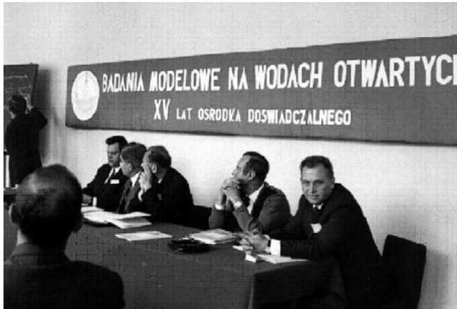
Fig. 5. Scientific session on the 15th anniversary of the Ilawa Centre

the development of the "School of Captains", first on the Jeziorak Lake and later on the nearby Silm Lake, as well as with the research work conducted there, scientific conferences devoted exclusively to ship manoeuvring were increasingly needed. The birthplace of those conferences, international from the start, was Ilawa. As it had been with HYDRONAV, they started modestly as a Ship Manoeuvring Workshop – Manoeuvring Qualities in Ship Design, on 4–7 October 1993, organized by the Division of Hydromechanics, Faculty of Ocean Engineering and Ship Technology, Gdansk University of Technology with cooperation of the Foundation for Safety of Navigation and Environment Protection, with 12 papers prepared by 14 authors. Two years later the Foundation for Safety of Navigation and Environment Protection organized in Ilawa, on 16-19 October 1995, the first International Symposium on Manoeuvrability of Ships at Slow Speed, with 23 papers prepared by 41 authors. It was then decided that those conferences would be held every five years. The consecutive ship manoeuvrability conferences were organized in 1999 and 2005 but as joint symposia with HYDRONAV. Those combined conferences received an own acronym - HYDMAN.