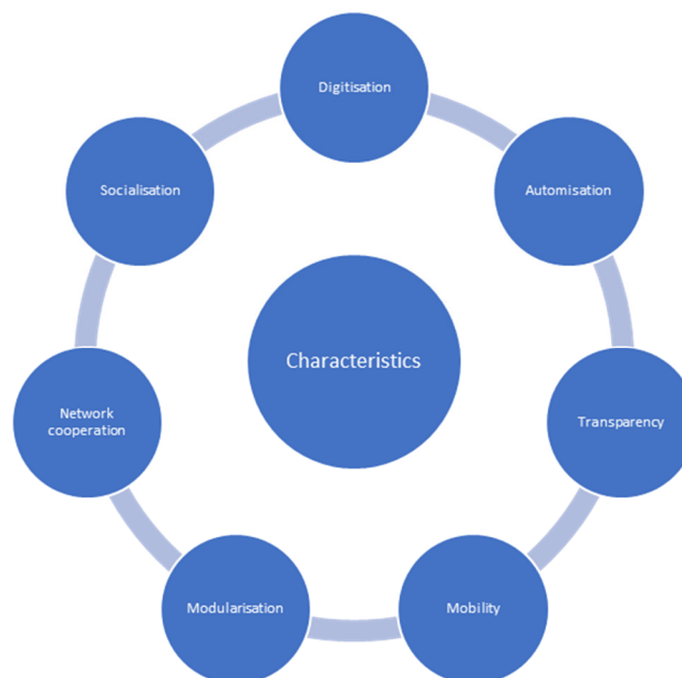
Fig. 2. Seven features most frequently considered in relation to Industry 4.0