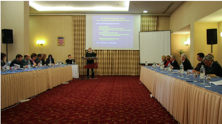
Fig. 4. 20th Session of the East Central and South-East Europe Division of the UNGEGN (Zagreb, 2011)

Directly after the founding of the UNGEGN, the Working Group on Romanization Systems was formed to deal with the transliteration of non-Latin scripts. As for transcription, although specific transcription systems are not dis-