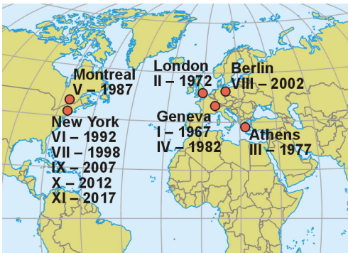
Fig. 1. Locations of United Nations Conferences on the Standardization of Geographical Names (after M. Zych)

ficzny”) providing the most systematically reported information (see Literature). In 1969, an article appeared from Lech Ratajski in which the author presented the issues taken on by (as he called it) the “United Nations Conference on the Unification of Geographical Names” and outlined the organisational activities preceding the meeting (L. Ratajski 1969). From a historical perspective, this is an interesting account of an active participant in the conference, who assessed and described in detail the principles and objectives of the United Nations Group of Experts on Geographical Names (UNGEGN) at that time.