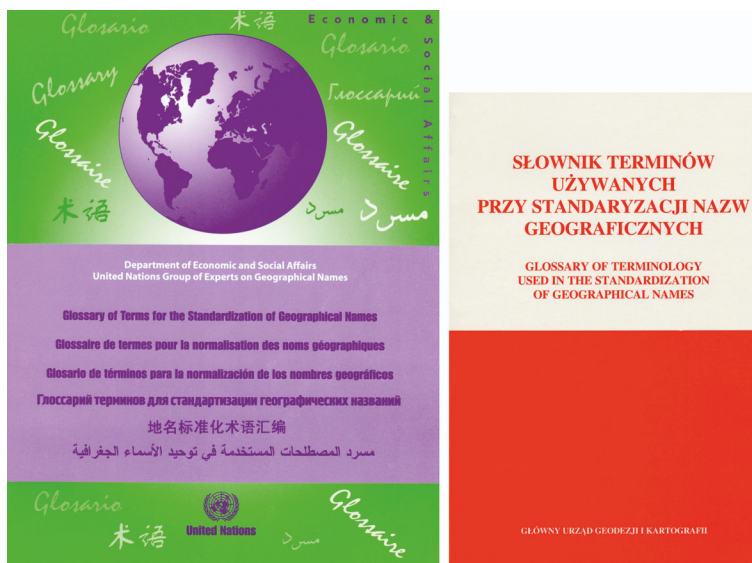
Fig. 3. Glossary of Terms for the Standardization of Geographical Names – UNGEGN publication of 2002 in six official languages of the UN and the Polish edition of 1998

of languages and script systems, recommending the determination of the form of each name in the Latin alphabet – a procedure known as ‘romanization’ ( Glossary of terms... 2002 ) 10 . In practice, there are two major models of romanization: transcription and transliteration. Transliteration means the use of an alphabetic writing system to render a single graphic symbol from system A using a single graphic symbol from system B; the idea of transliteration is the complete conversion of entry B into entry A. However, this model situation rarely occurs. Over the years, individual states have taken to proposing systems for transliterating their writing systems into the Latin alphabet and, following discussions at the UN (at UNGEGN conferences), other countries have tried to apply them on a voluntary basis. Transcription refers to the writing in one writing system of the speech sounds of another language; in this case, transcriptional tables are an internal matter for each country. The advantage of transcription is that it gives an idea of the