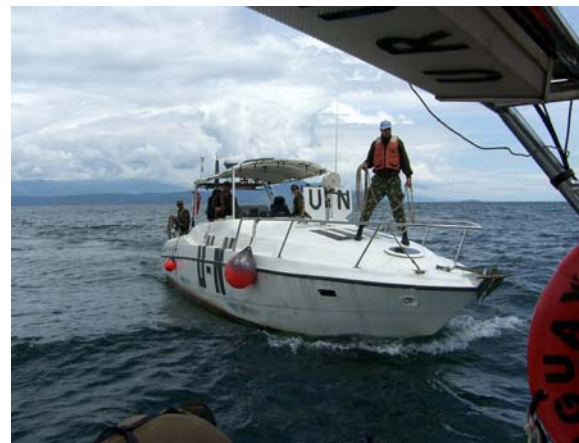
Figure 2. Uruguayan riverine patrol boat class A UPF [5]

South Sudan (UNMISS) and Mali. Also UNOCI and UNMIL investigated possibility for waterborne patrols on Cavalla River (border Cote d'Ivoire/Liberia).[4] In recent years, Uruguayan riverine companies are deployed in UN mission MONUC-DR Congo, equipped with two river patrol boats class A UPF (Unidad de Patrulla Fluvial) class Mk 44 and numerous rigid-hull inflatable boat (RHIBs) mark Zodiac Mk IV. The main characteristics of river patrol boat: length 11.30m, width 3.25m, draft 0.6m, Complements 2+6, armament 1 x Browning M2 HB 12.7mm ( forward-mounted ), 2-3 x machine guns FN MAG 7,62mm ( aft/side-mounted ). (Fig. 2.)