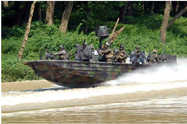
Figure 4. US Navy Special Operations Craft – Riverine SOC-R

carrying humanitarian aid. In Mission in Mali (MINUSMA) Bangladesh Riverine Unit carry out a river patrol. (Fig. 3.)