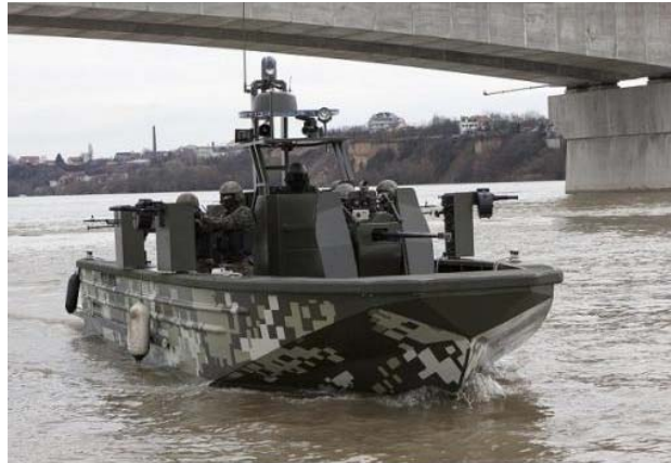
Figure 5. Multirole Fast Combat Boat – type PREMAX, Production of Serbian State Owned Company

riverine unit is multirole fast combat boat type PREMAX as Serbian state own product which capabilities are fully compatible with the UN requirements for light patrol craft. Also, it possesses similar features as special operations craft used by U.S. Navy riverine forces for in-shore interdiction, riverine patrolling and direct action missions. Fig.5.[9]