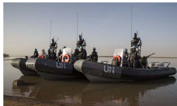
Figure 3. Bangladeshi RHIBs in eastern Mali [7]

Uruguayan companies under the UN mandate are in charge of conducting operations on Lake Kivu and Lake Tanganyika with armed personnel onboard in an effort to beat armed robbery, smuggling and illegal taxation imposed by local armed groups on commercial vessels. Major troop contributors to MONUSCO had identified the need for more surveillance assets and greater riverine capabilities to enhance coverage on lakes and rivers in the Kivus. [6]