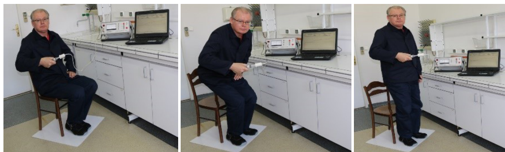
Figure 3. Measurement station for measuring the electrostatic voltage generated on the human body when standing up from a chair. The test subject has an insulating board under their feet ( R_{iz} \geq 10^{14} \Omega )

The results of tests conducted in Trial III, carried out under the conditions: t = 23 \text{ }^\circ\text{C} , \text{RH} = 40\% , C = 150 \text{ pF} – electrical capacitance of the human body involved in the trial, C_u = 160 \text{ pF} , are summarised in Table 3.