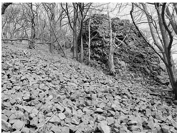
Fig. 3. Tor and rockfield at Ostrzyca Proboszczowicka (Sudetes)