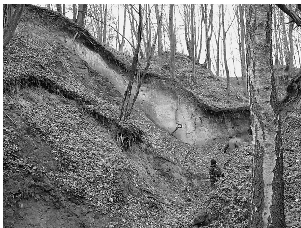
Fig. 4. Loess gully (Lublin Upland)