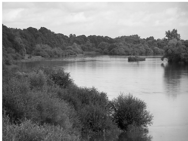
Fig. 5. Bug river valley (vicinity of Nur)