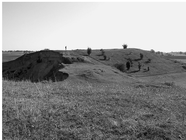
Fig. 6. Wielowiczek esker (Pomeranian Lakeland)

not very numerous because of their large size, which makes it difficult to find an appropriate observation point. Individual dunes and dune fields, also in marginal valley location, were observed on the sandurs. Eskers also occur (Fig. 6). As living and young landforms, the river valleys in this belt are the most numerous group among fluvial landforms, while the other elements are represented to a smaller extent. Particularly noteworthy are the rare and very young “residual hill” landforms developed as a result of the cementing of glacial sediments and removal of non-cemented particles. In one case, a cave form developed.