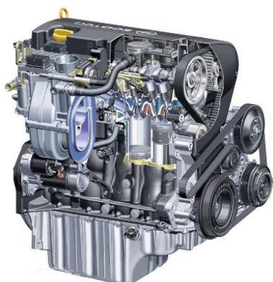
Fig.2 Petrol Engine 1.2 ECOTEC®