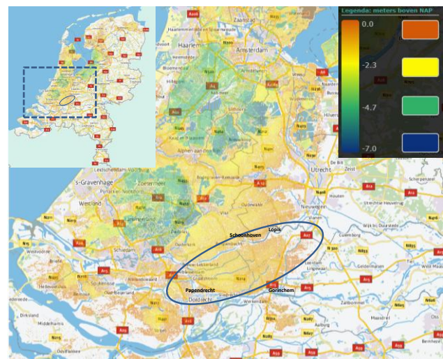
Figure 2. Location of Gorinchem and the polder on an elevation map of the Netherlands

This test case involves public authorities and critical infrastructure operators which will participate to the command post exercise. Many dependencies have been identified between the water flooding and others CI sectors such as gas transport, drinking water, telecommunication and the water board which is specific to the Netherlands.