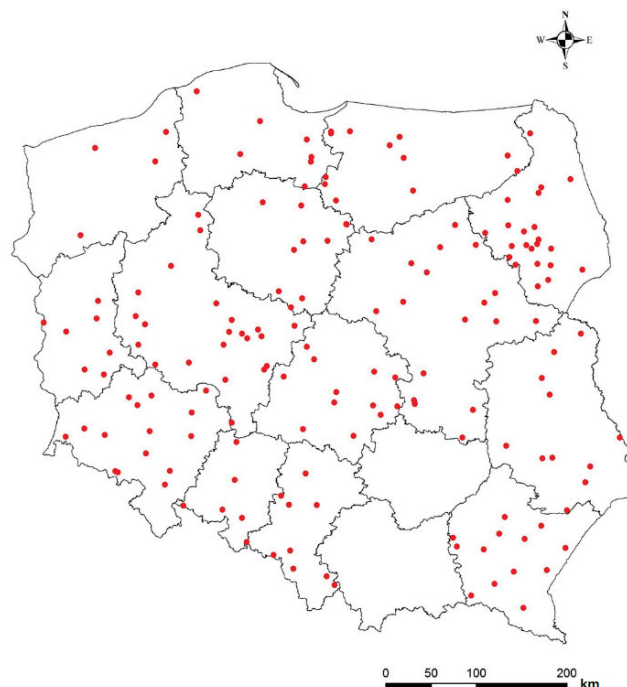
Fig. 1. Location of soil sampling sites in grasslands in Poland for the determination of grain size, mineral nitrogen and organic carbon; source: Nawalany (2022), unpublished