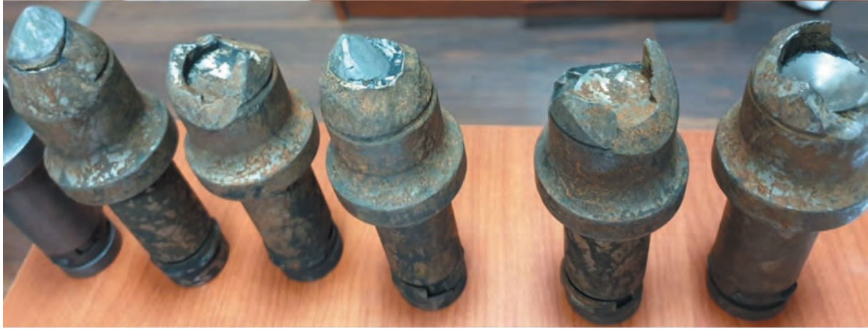
Fig. 2. Bits after one day of working from an unknown competitor

in their daily work. These include the use of inferior steel grades, poorer quality body processing, inadequate heat treatment resulting in increased brittleness of the body, or a faulty method of connecting the point to the body of the bit (Figs. 2 and 3).