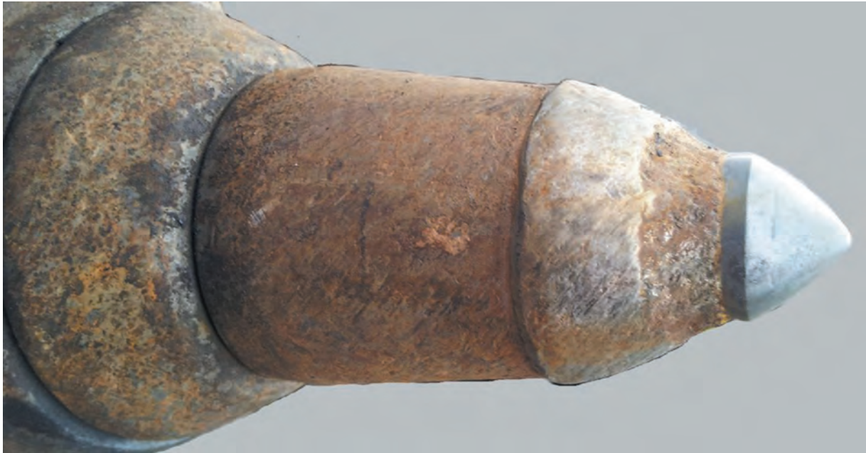
Fig. 4. Incorrect sizing of the sintered carbide insert to the hardness of the body and mining conditions

(without the cone) completely unworn. This indicates that it had been overbuilt unnecessarily, only increasing the cost of the tool.