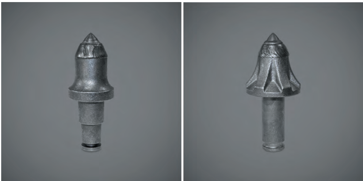
Fig. 5. Examples of Betek bits with a protective layer in the working (point) section [2]

In general, any increase in the service life of cutting tools has an impact on improving the efficiency of the entire mining system by reducing the frequency of tool replacement.