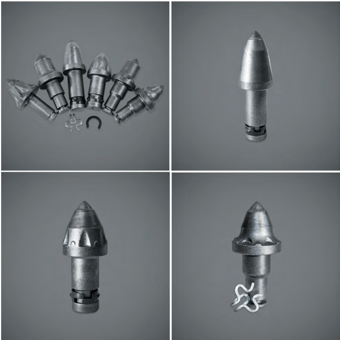
Fig. 1. Examples of the bits manufactured by Betek [2]

An extremely important element in the design of the bit is the correct technique of connecting the sintered carbide insert to the body, as well as the composition of the brazing compound itself, which is produced in-house and constitutes a Betek trade secret. The connection made in this way fills one hundred per cent of the space between the insert and the body of the bit. This is fundamental to the durability of the bit and the absence of situations in which the insert falls out during a mining operation.